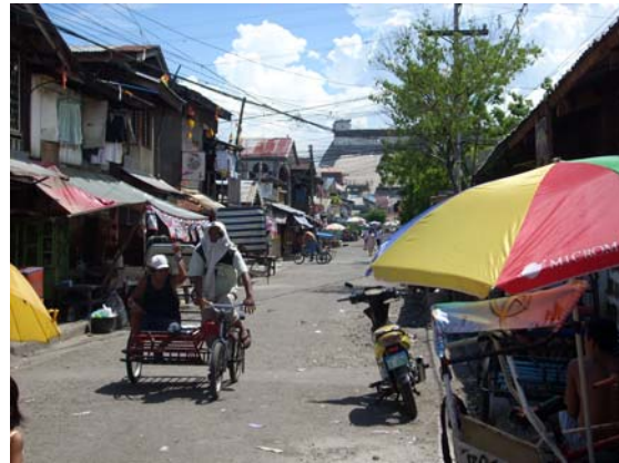
Street life in Suba