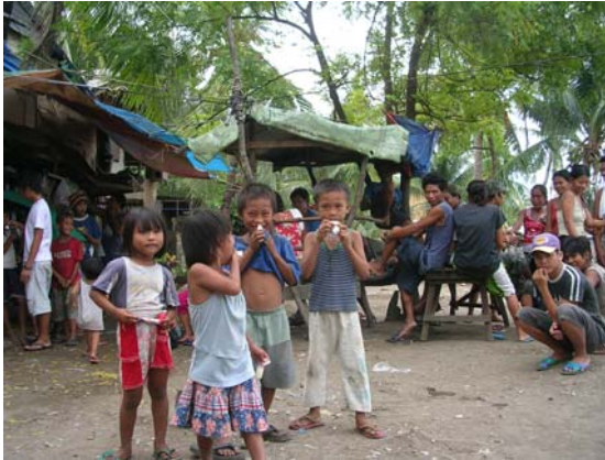
Street life in Inayawan