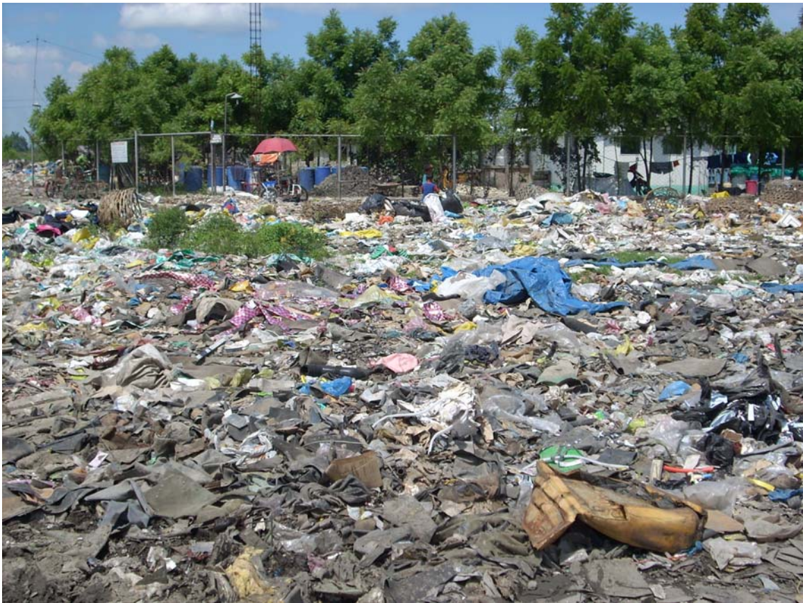
Dumpsite area, Inayawan

Secondly it is socially relevant, because the final goal of this research is 'sustain environmental health activities' or simply; to improve environmental health. This means that the research tries to find a way in which local inhabitants can be involved in solving environmental problems. As mentioned before, these problems are large and complicated. It would be very useful to make the people aware of the importance of good environmental health policy. Hopefully it will stimulate them to participate in the environmental health activities.