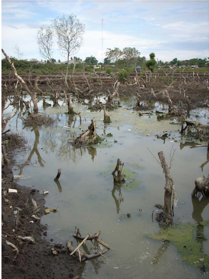
Polluted fish ponds, Inayawan