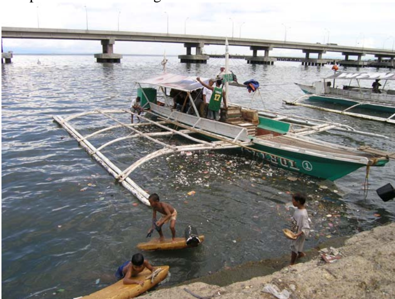
Suba fish port. Children playing in the water which is polluted by garbage, people relieving themselves and waste from the coconut oil factory.

Some observations are about the respondent, his non-verbal communication or his stories after tape recorder has been stopped. Other observations are about the people surrounding us; they listen, sometimes interfere in the conversation, they are very curious because it is rare that a white person visits their area. The last category of observations are of contradictory behaviour, the so-called attitude-behavior discrepancies (Caral, 2007, 1). An example of this, is when respondents answer that they think garbage is the biggest problem in Inayawan. After the interview the respondent receives bread, he eats it and afterwards throws the plastic in the street! Observations like this are attitude-behavior discrepancies, which are very interesting for the research. Some of our observations are also put on a picture. If it is useful for the story, we complete the written report with some pictures of the barangays. We have made pictures of the toilets, water pumps, the dumpsite and other living conditions.