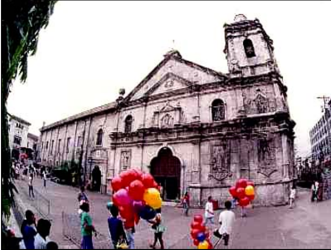
Basilica Minore Del Santo Niño (Cebu-City)

Especially in the urban poor areas, catholic churches are very active in improving livelihood. For example in Suba and Inayawan, where they built primary schools. Churches reach out to the poor, that's why they are well-known and appreciated by the inhabitants.