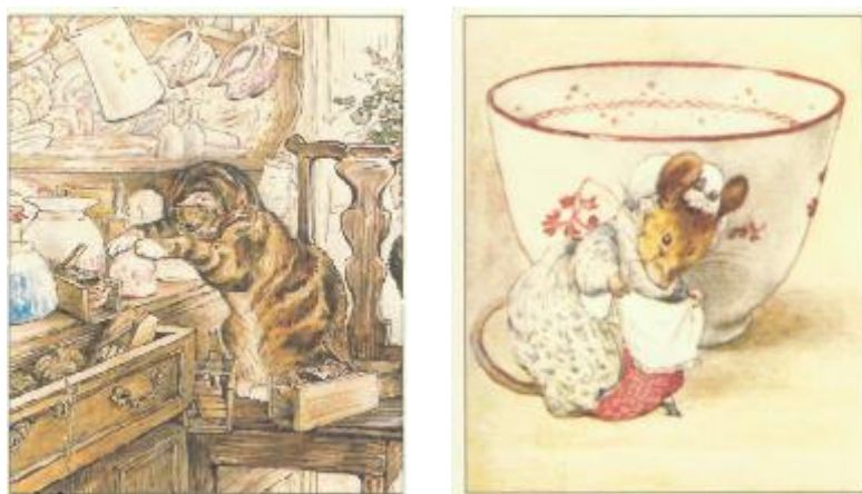
Fig. 16, 17. China in The Tailor , 1903. Potter, Beatrix. The Complete Tales . London: Penguin, 2012. Print.

The Tailor of Gloucester , which was Beatrix Potter's favourite tale, shows her sense for detail not only in the portrayal of her animals, but also in the design for their surroundings. Potter had become an avid collector of pottery, china, and furniture: "Over the years she had collected pottery and china and she had some fine examples in cabinets there. She also collected furniture, about which she was very knowledgeable" (Taylor 114). This love for collecting, in particular china, is included in the tale of the tailor.