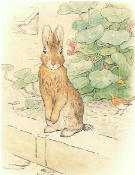
Fig. 15. Peter Rabbit, 1902. Potter, Beatrix. The Complete Tales . London: Penguin, 2012. Print.

drawing animals, but also by correctly copying their behaviour. The following picture gives an example of Potter's naturalistic observation.