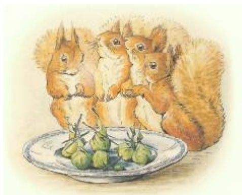
Fig. 21. Squirrels and plate, 1903. Potter, Beatrix. The Complete Tales . London: Penguin, 2012. Print.

Potter also uses humour in her drawings and pictures accompanying the stories. The picture of the squirrels presenting pudding to Old Brown hardly makes sense, since it takes place in the middle of the woods. How would either the squirrels or Old Brown have been able to obtain such a plate as is portrayed in the picture?