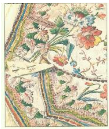
Fig. 18. Waistcoat in The Tailor , 1903. Potter, Beatrix. The Complete Tales . London: Penguin, 2012. Print.

This can certainly be observed from the following picture from The Tailor .