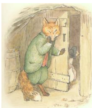
Fig. 22, 23. Simpkin, 1903. Fox, 1908. Potter, Beatrix. The Complete Tales . London: Penguin, 2012. Print.