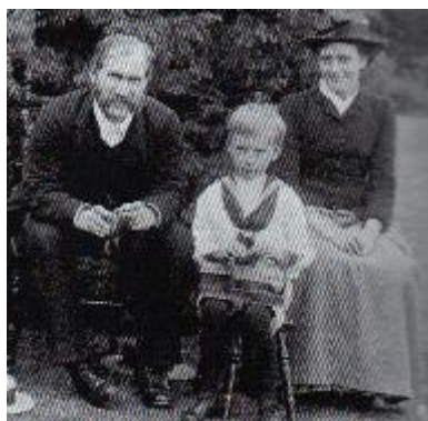
Fig. 4. Beatrix Potter with Hardwicke Rawnsley and son, 1885/1887.

The following photo shows Beatrix Potter together with Hardwicke Rawnsley and his son. Potter is dressed plainly in this picture as well. A simple dark vest, a plain skirt, and a hat with some embellishment, although limited to a fabric ribbon.