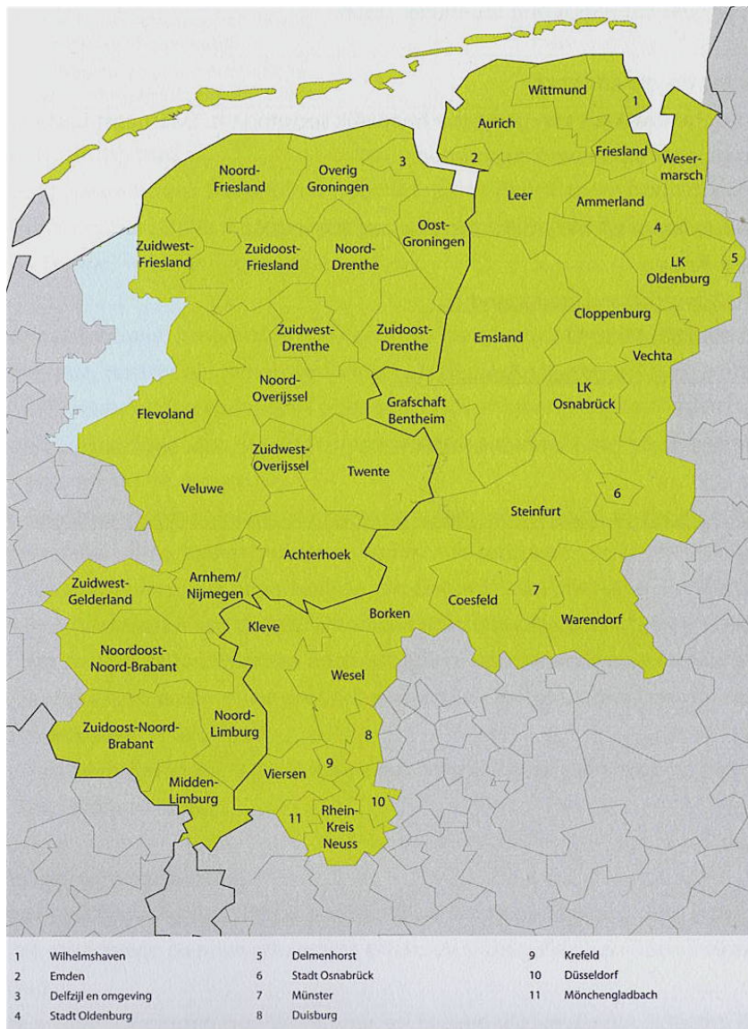
Figure 1: The Dutch-German Interreg program area (source: Europese Subsidiewijzer 2014-2020 VNG).