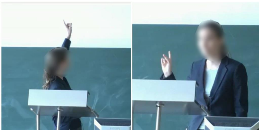
Figure 2. Index-pointing

If the answer to all four of these questions was ‘yes’, the movement was coded as a deictic gesture. To illustrate what a deictic gesture may look like, the difference between index-pointing and open hand-pointing can be seen in figure 2 and figure 3, which include stills from the video material.