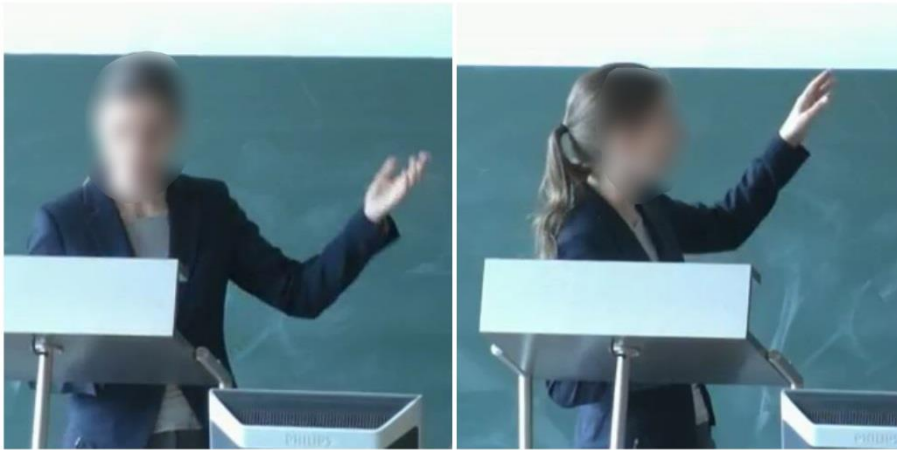
Figure 3. Open hand-pointing