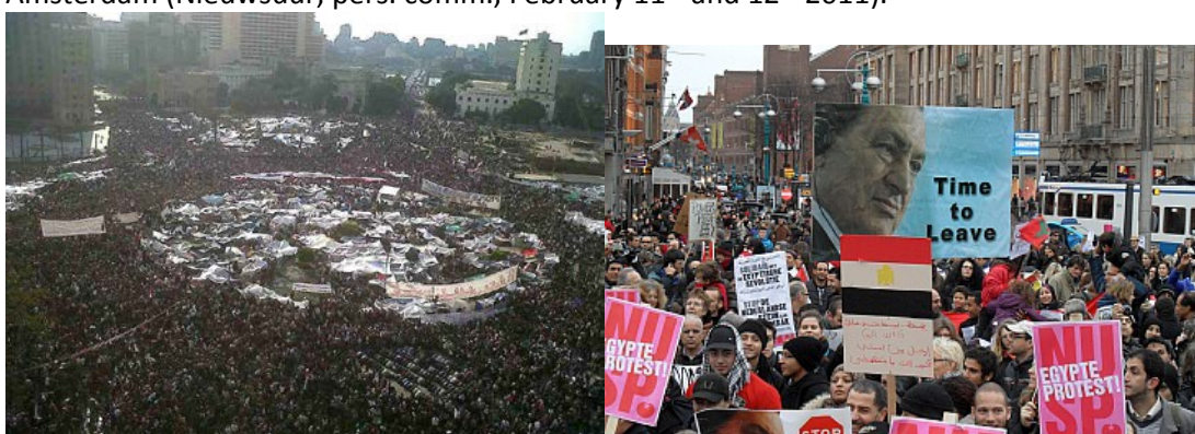
(Figure 1, Egypte, Christipedia.nl, Februari 11 th 2011) (Figure 2, Veel steun voor Egypte op manifestatie in Amsterdam, mrwonkish.nl, Februari 6th, 2011)

Since the end of 2010 the world news is dictated by political events in North Africa and the Middle East. Events that can be best described as an outburst of discontent after decades of oppression. It all began in Tunis and soon in several countries of North Africa and the Middle East thousands of people were peacefully demonstrating to gain more freedom and democracy (R. Meijer, pers. comm., February 11 th 2011). The achievements of the protesters differed: in some countries the government was overthrown, whilst in others people are still demonstrating today. One of two countries where the government was finally overthrown is Egypt. From the moment the protests in Egypt started on January 25 th the whole world was able to follow the developments in Egypt by the media. During the news broadcasts of February 11 th and 12 th in the Netherlands, besides the massive blissful crowd on the Tahrir Square, we saw cheering 'Dutch-Egyptians' gathered together in Amsterdam (Nieuwsuur, pers. comm., February 11 th and 12 th 2011).