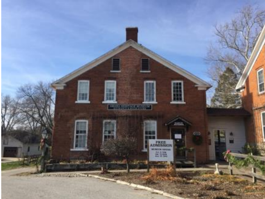
Fig. 5. Synofzick, Marie. "Amana Heritage Museum." 2016. JPEG file.