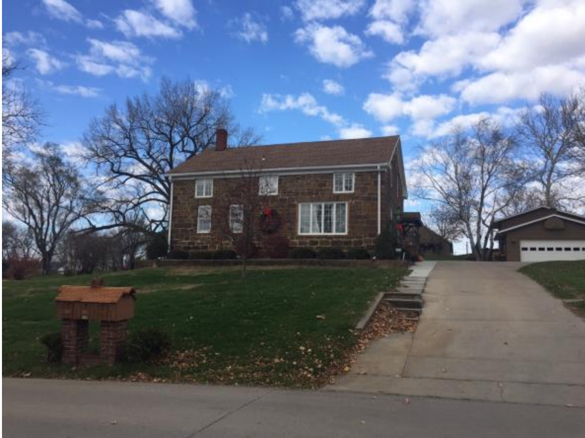
Fig. 3. "Former Communal Kitchen in High Amana." 2016. JPEG file.

The German language which had always influenced everyday life in Amana and which had survived so long, began to deteriorate among members slowly after the Change, but especially quickly during the years of the Second World War. Amana members “discouraged the speaking of the German language” in order to show their loyalty to their homeland: America (69). However, German was still the prevalent language at home in the colonies and everyday life was regulated in the language of the old homeland. One might argue that migration and acculturation did not happen until 1932 and the following years altogether, since the community did not change shape from its origins in Germany. Communal living had been established in European living quarters, long before the group left for America. In this light, only after disembarking from this lifestyle were the Amana people forced to interact with and adapt to American society. Before their community shielded itself from external influences, and was not penetrated by American culture. It is therefore especially interesting to look at more recent developments in peoples’ identities, which will be done through personal interviews.