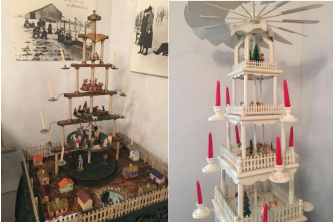
Fig. 8. Synofzick, Marie. "Christmas Pyramid I." 2016. JPEG file.