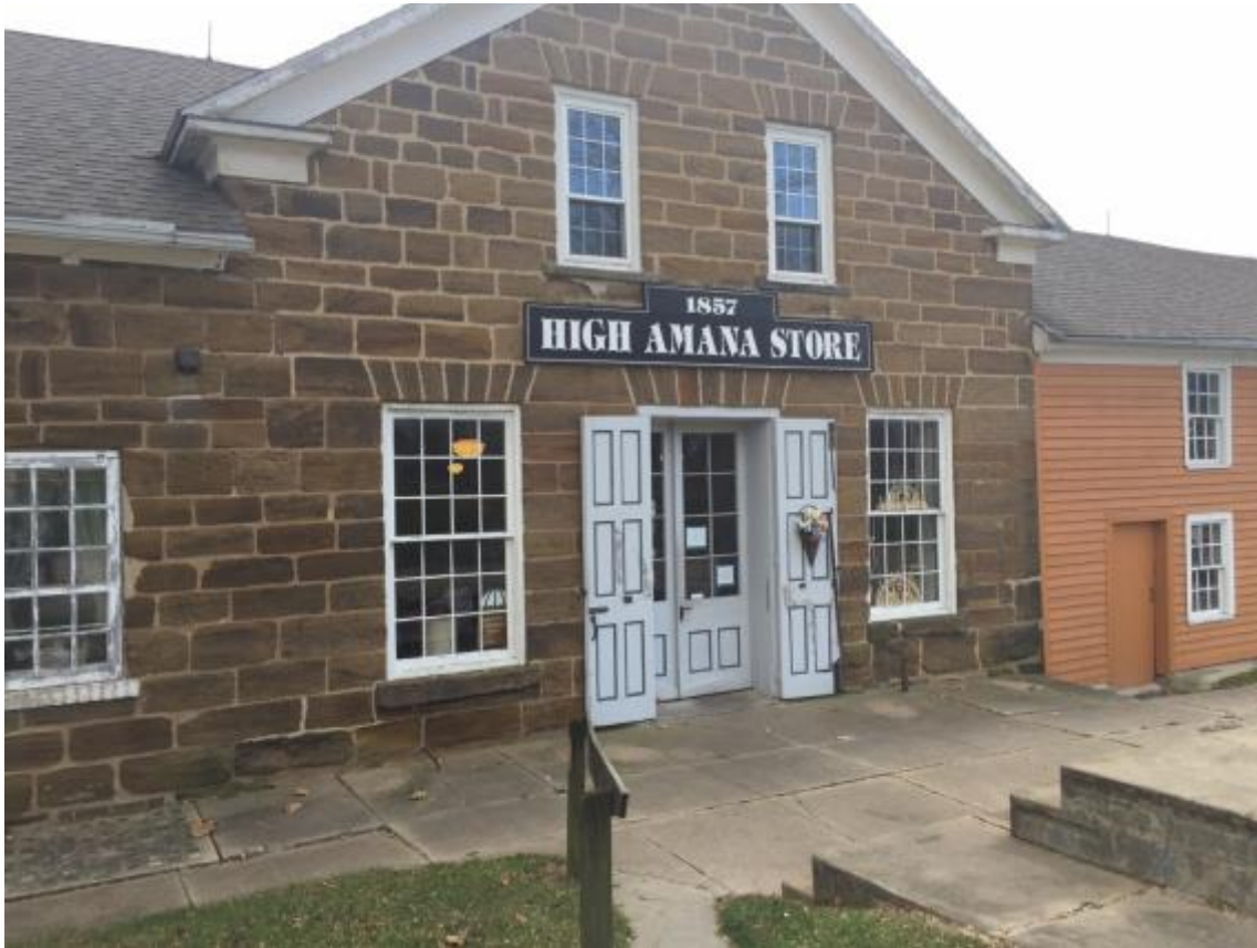
Fig. 2. "High Amana General Store." 2016. JPEG file.