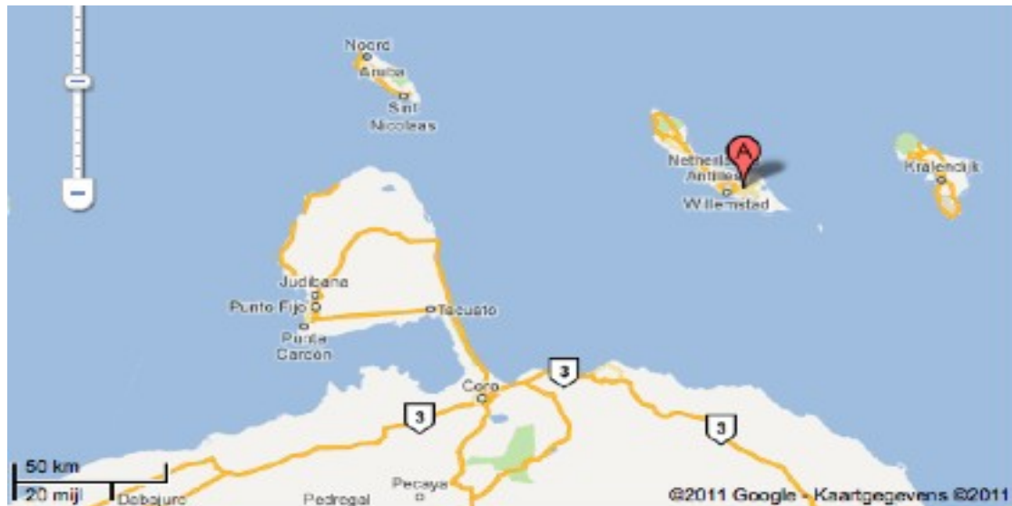
Figure 1. Map of Venezuela and the Dutch Antilles 4

The large landmass in the lower section of the map shows the coast of Venezuela. The three tiny islands just above are the Dutch Antilles and Aruba. The islands are (in order from West to East): Aruba, Curacao (indicated by the red pointer) and Bonaire. As the map shows, all islands are close to Venezuela. The distance between Aruba and Venezuela is only about 20 miles. According to the United Nations Convention on the Law of the Sea (UNCLOS) 5 , article 3 in section 2: 'Every state has the right to establish the breadth of its territorial sea up to a limit not exceeding 12 nautical miles, measured from baselines determined in accordance with this convention.' Since 12 nautical miles equals 14 'land' miles, it shows that, although Aruba is close, Chávez' claim is not viable on geographical grounds according to the UNCLOS.