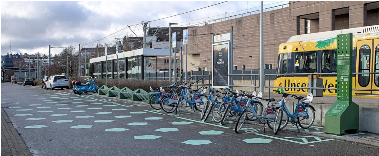
Figure 1: an example of a mobility hub in Stuttgart, Germany