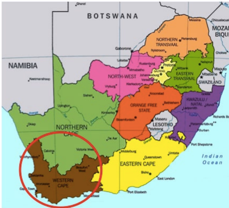
Figure 2: The Western Cape province in South Africa