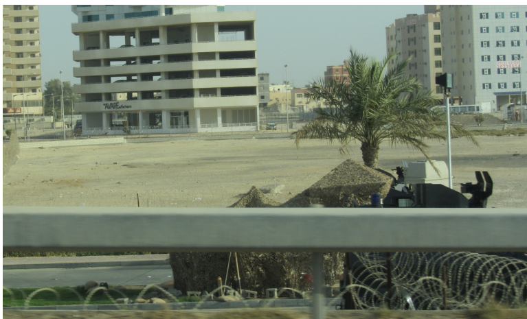
The Pearl Roundabout in Manama. Clockwise: before, during and after the protests.