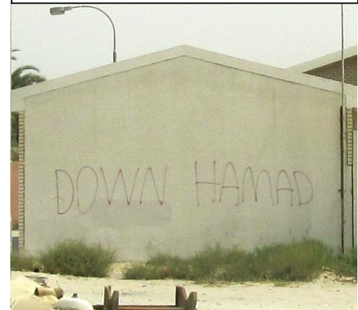
Graffiti in Bahrain symbolizing the cause of conflict?

This question will be answered structurally. Firstly it is important to gain an understanding of the situation of Bahrain, what problems the country faces, and how this conflict relates to the past, and to former conflicts. Information on this will provide guidance on what the causes of the most recent conflict are. This will be done in chapter two; the contextual framework. The second step is to analyze possible causes of conflict, and ways in which these causes can be addressed in theory. This is done in chapter three; the theoretical framework. This chapter also demarcates the main definitions that are used throughout this research, in order to avoid misunderstandings. These two chapters will be based on existing literature. They will summarize existing information and theories, and look critically towards this information by means of a perspective focused on Bahrain. The following part of this research will be based on more recent information which is in hands of Bahrain experts, the Bahraini people, and policy makers that are occupied with Bahrain. Therefore, the only way to obtain this information is through interviews. Further explanation and justification for the chosen methods is given in chapter four. However, a preview of the