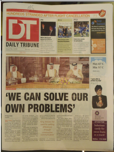
Daily Tribune June 25, 2012

Of course policy regarding Bahrain also depends on other influences beside goodwill. The United States are currently very active in the region, which decreases the chance for another project in the same region, as long as it is not necessary to intervene. As was seen, the Netherlands have clear policy guidelines and if Bahrain would not fit in such policy of a country, the chance for political action is small. As the main cause, the political system, is seen as an internal factor by the international community it does not see itself as the main actor to address the cause. The Bahraini government, at least the king, agrees on this as could be seen on the front page of the Daily Tribune of June 25 th , 2012. The other motive of the international community is that it was fully occupied with bigger conflicts in the region, like Syria and Libya. This is understandable, but as said, Bahrain is important, and when conflict mediation and resolution is successful here, it could be an extra stimulant for the other conflicts too. These are factors that are part of the political arena, extremely difficult to deal with. This research might help in giving clear indicators and stressing the importance of assisting Bahrain.