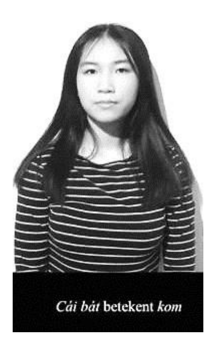
Figure 2. Example of the presentation of the word bowl in the no gesture condition