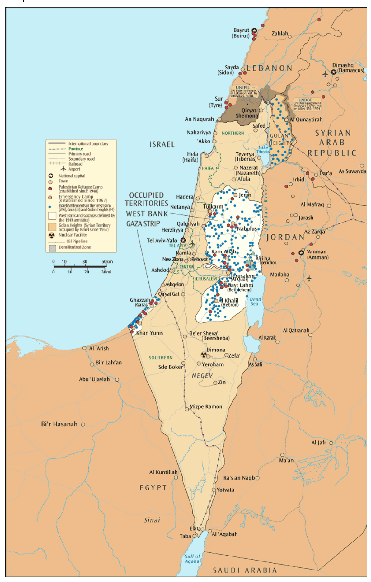
Appendix II. Map of Israel and the Palestinian Territories