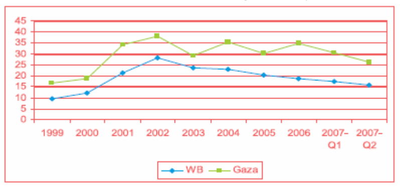
Figure 5.1: Official unemployment in West Bank and Gaza

increase in poverty due to the growing unemployment among the Palestinians. The unemployment rate in WBGS has gone up from 10% at the eve of the Second Intifada in 2000 to 22% in 2007 (See figure 5.1). The unemployment rate in Gaza (29%) is higher than in the West Bank (19%) due to the repeated closure of the borders and the restrictions on imports and exports.<sup>99</sup>