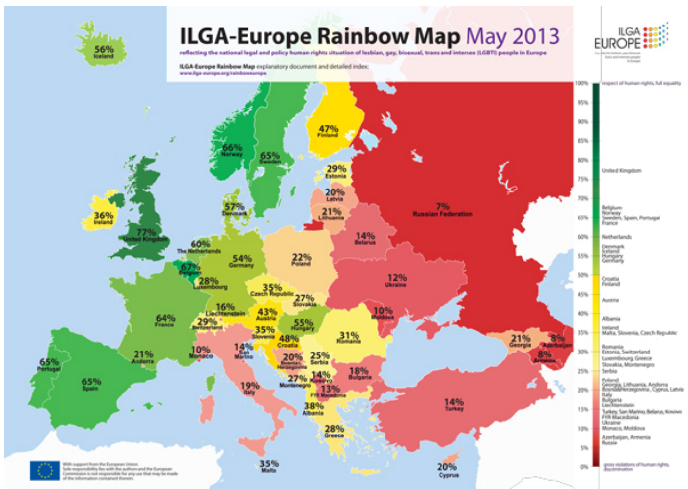
Figure 1: The Recognition of LGBT Rights in Europe. (ILGA-Europe 2013 a)

Finally, the conclusion briefly sums up the main findings of this study and moves on to place it in a broader (scientific and to some degree societal) context. In doing so, both the generalizability of the results and the (dis)advantages of this study's methodological approach are discussed. Moreover, suggestions for future research are done.