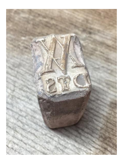
Fig.1, Photograph of the stamp of the brand and an artisan's initials. https://www.summerillandbishop.com/blogs/meanderings/exploring-artisans-inside-the-astier-de-villatte-atelier.