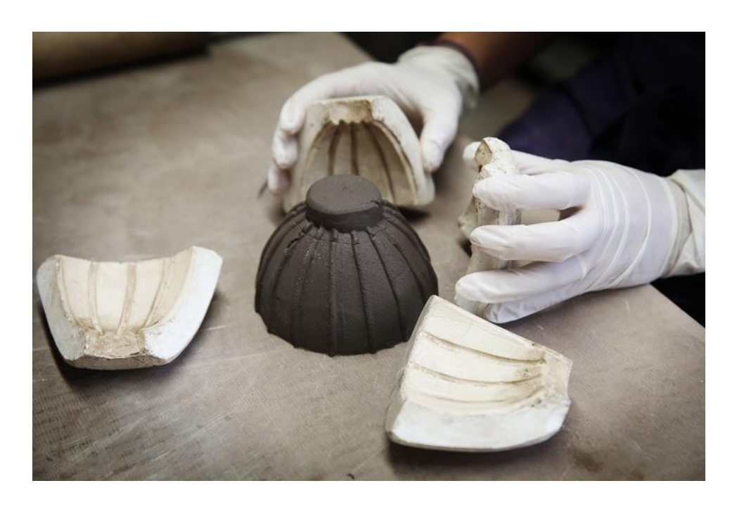
Fig. 4, Photograph of how a cup is created by using press mold technique at Astier de Villatte's workshop. artilleriet-journal.se , 25 September 2018, https://artilleriet-journal.se/Astier-de-Villatte.