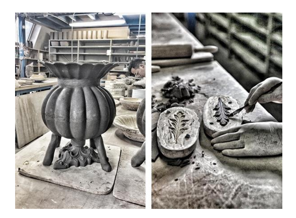
Fig. 12, The making of Astier de Villatte's handmade Objects. Summerillandbischop .com, https://www.summerillandbishop.com/blogs/meaderings/exploring-artisans-inside-the-astier-de-villatte-atelier.