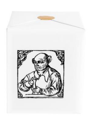
Fig.10, "Stockholm candle." johnderian.com , 9 July 2021, https://www.johnderian.com/products/bgestc10-jpg?_pos=11&_sid=ae0a62112&_ss=r