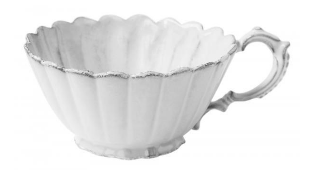
Fig. 5, "Marguerite tea cup", Astier de Villatte , 12 July 2021, https://www.astierdevillatte.com/product/429/marguerite-tea-cup?v=429