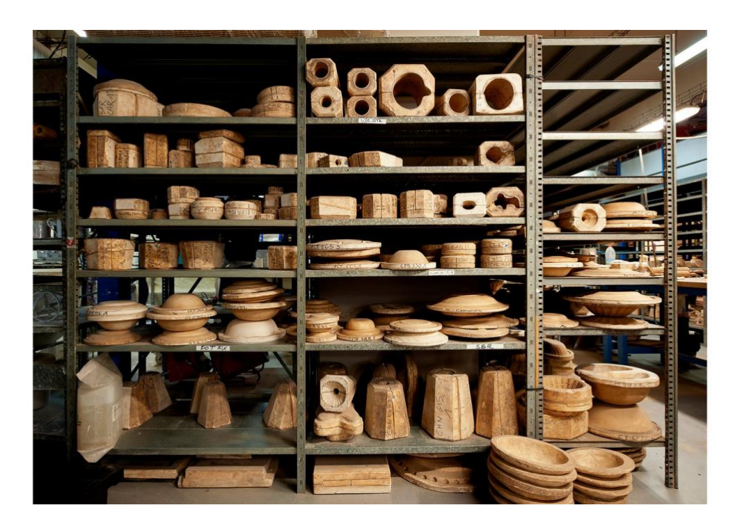
Fig. 3, Woodward, Jooney. "press mold.", Vogue.com , 28 November 2018, www.vogue.com/projects/13547240/inside-astier-de-villatte-paris-workshop.