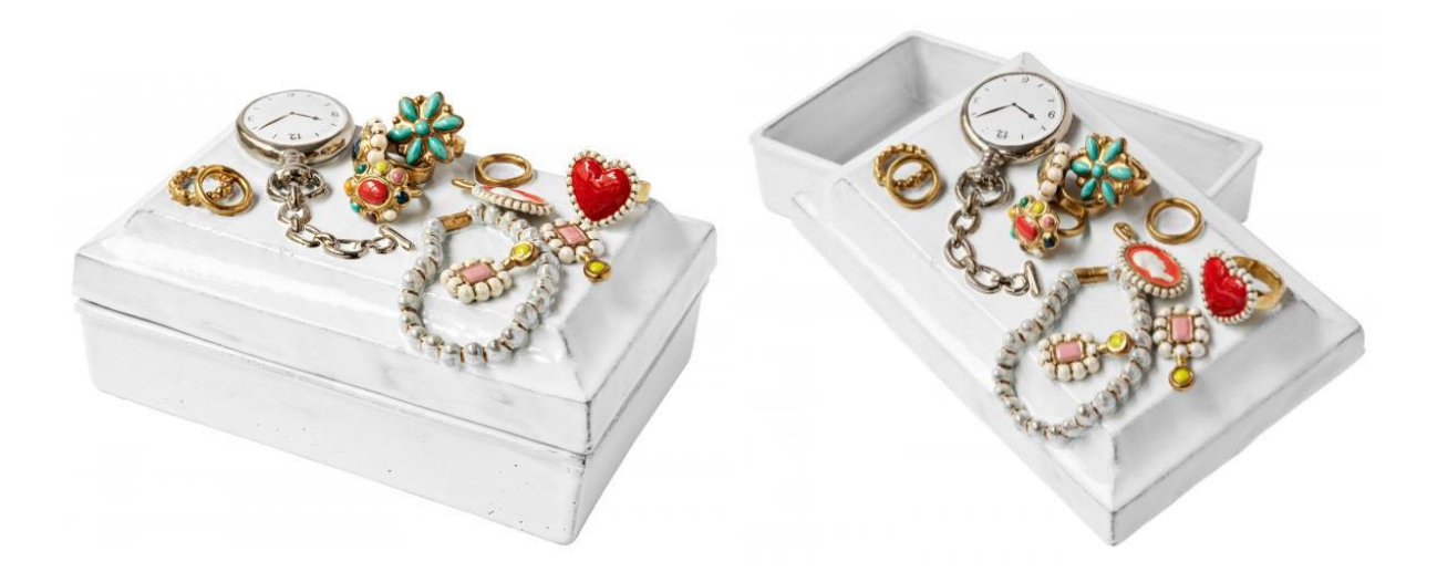
Fig. 11, "Victorian Jewellery Box.". Astier de Villatte.com , https://www.astierdevillatte.com/product/891/jewellery-box?v=891