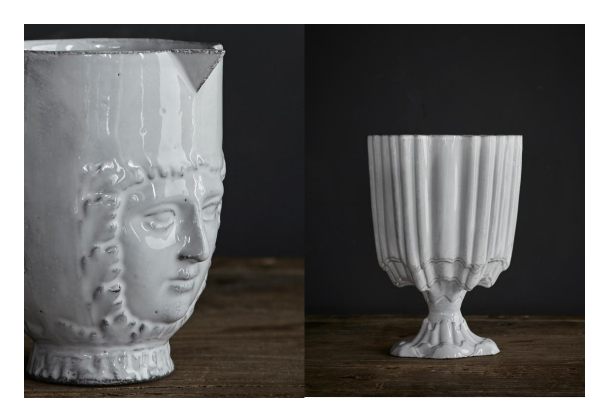
Fig. 6, Astier de Villatte's handmade objects. artilleriet-journal.se , 25 September 2018, https://artilleriet-journal.se/Astier-de-Villatte.

Benjamin writes, "the uniqueness of a work of art is inseparable from its imbedded in the fabric of tradition... it is significant that the existence of the work of art with reference to its aura is never entirely separated from its ritual function" (215). This statement allows one thing to be argued: the aura of artworks is attached to tradition. Thus, craft as a traditional method of production may affect the way in which objects are perceived and valued. Benjamin notes that works of art can be perceived and valued on two levels: "cult value" and "exhibition value" (253). He argues that "artistic production begins with ceremonial objects destined to serve in a cult" (Benjamin 254). Cult value refers to how artworks are viewed with a ritualizing gaze (the objects of warships). Whereas exhibition value refers to a new function of art, mainly because mechanical reproduction has transformed how artworks are perceived and experienced. Benjamin states that mechanical reproduction liberates "the work