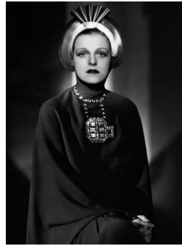
1.3 "Queen from 1930s movie"

The importance of beauty is again stressed because the Disney Company not only wants to educate its audience that evil never goes unpunished, but also that women who take action women that are "strong, active, and no-nonsense people who stop at nothing to get things done" (Davis 107) are unhappy and frustrated. The message that the audience gets from this is that in order to live a happy life, women have to be passive and not take action. Happiness thus appears to be linked to beauty, goodness and passivity. This also appears to be the case for Snow White and the Evil Queen; the beautiful young girl is willing to wait for happiness to come to her, and in the end Prince Charming finds her and they live happily ever after. Whereas the Evil Queen, whose beauty can never surpass that of Snow White and who actively pursues her goals, does not end-up happy; she even ends up dead. This constant emphasis on a woman's appearance is not something that only exists among women; it is also very much an issue among men. Men all want to have the most beautiful wife, and her looks