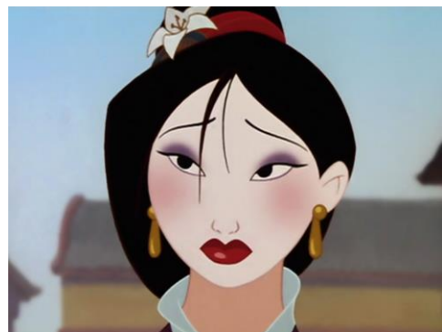
Image 2.2 Mulan at Matchmaker