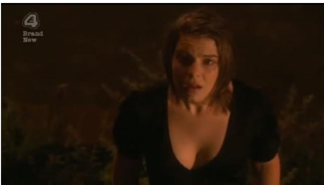
Shot 11, 44:18