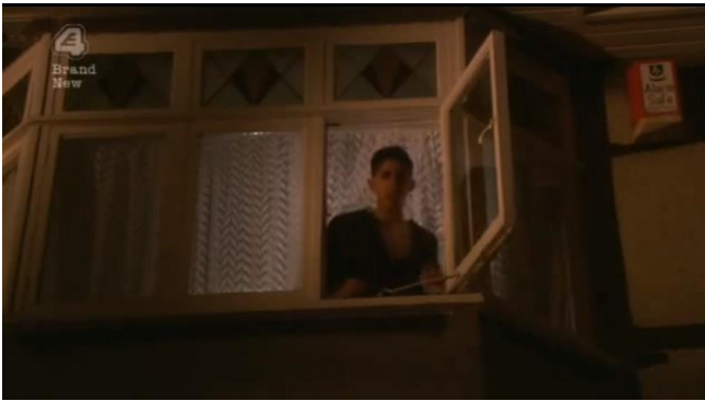
Shot 4, 44:02