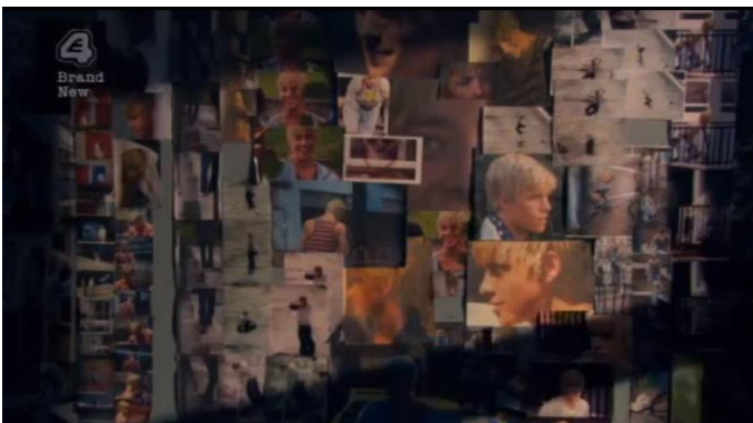
Shot 4, 01:31