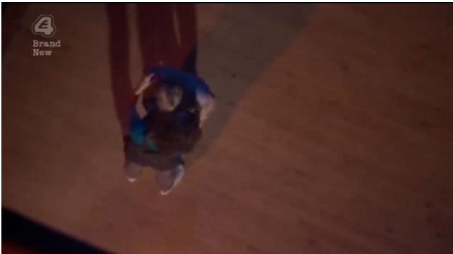
Shot 51, 07:41