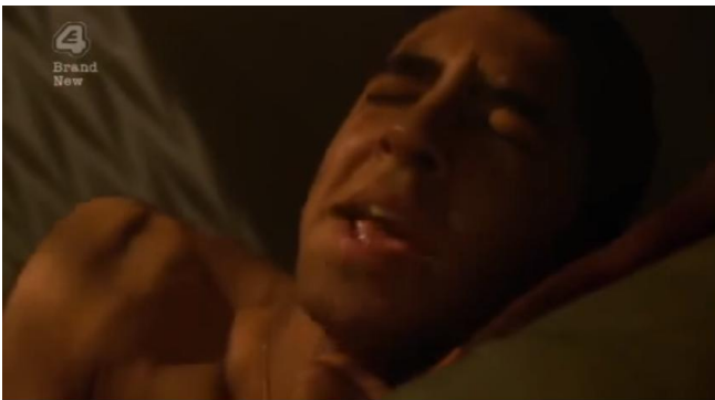
Shot 6, 45:13