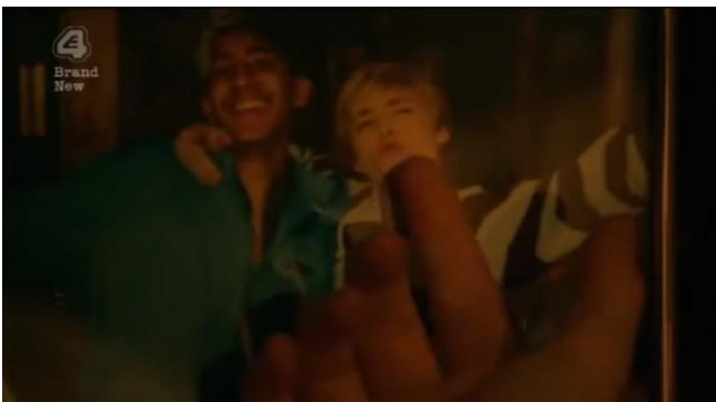
Shot 8, 45:37