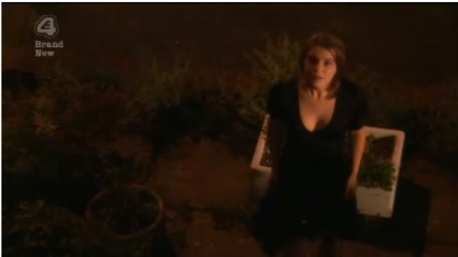
Shot 9, 44:13