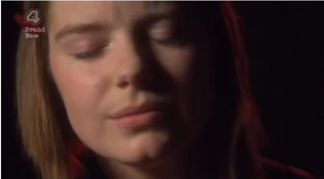
Shot 10, 04:42