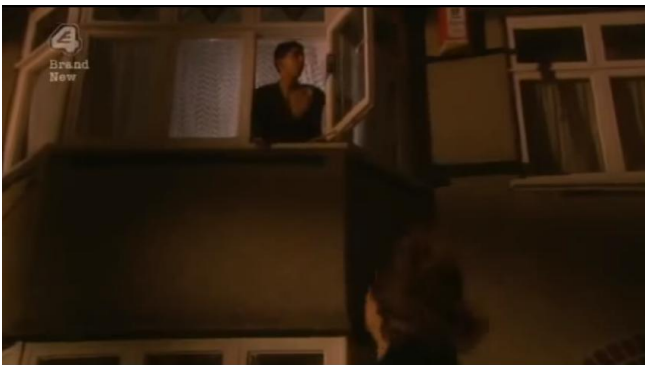
Shot 2, 43:57