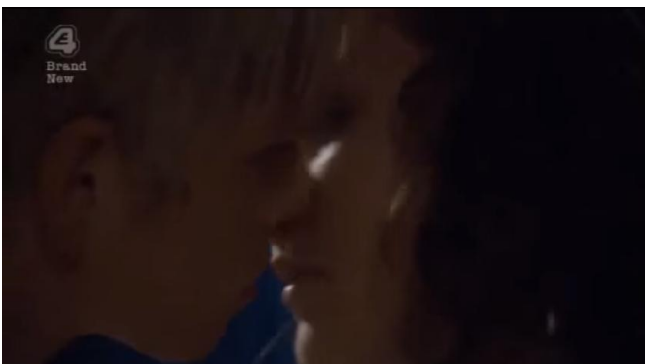
Shot 11, 04:44