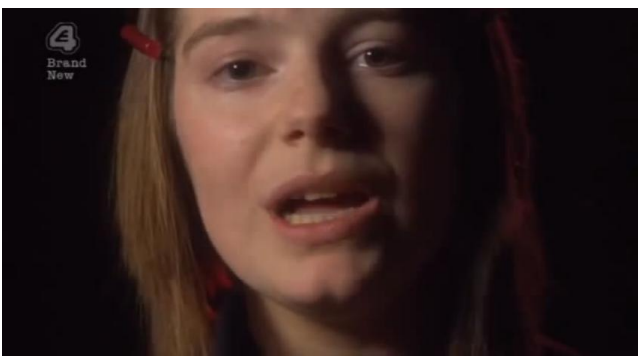
Shot 8, 04:31