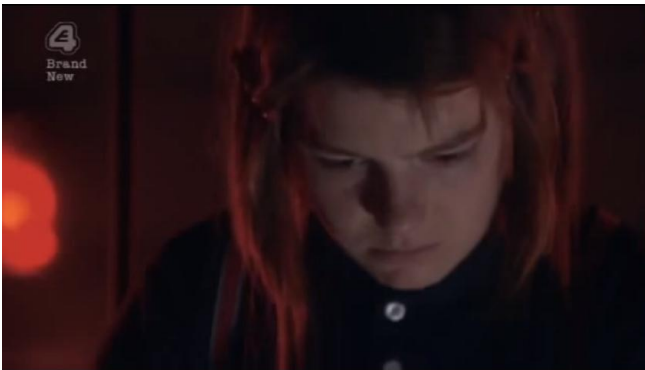
Shot 43, 07:12