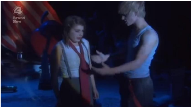
Shot 17, 41:40