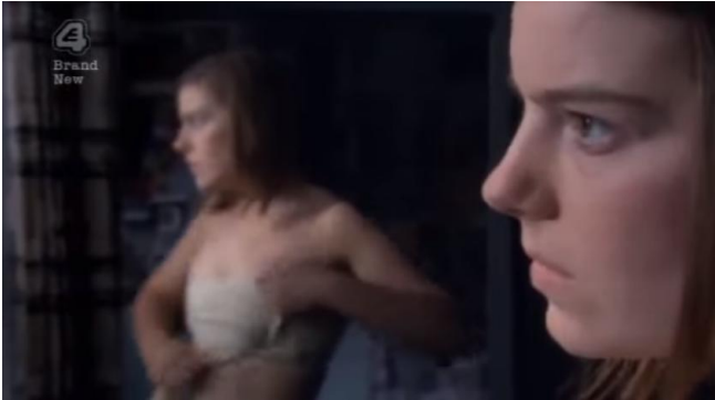
Shot 20, 02:34