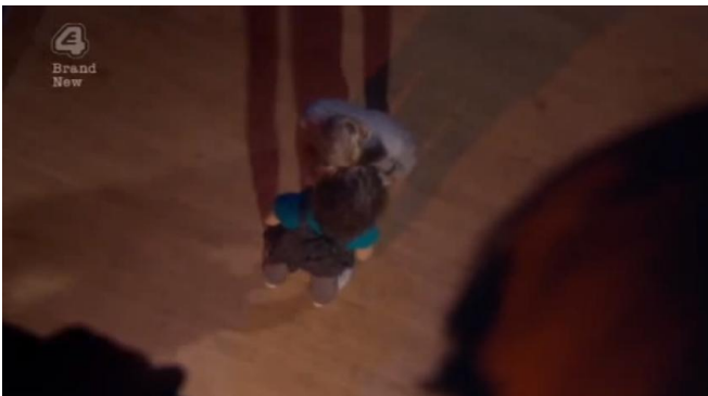
Shot 16, 04:58