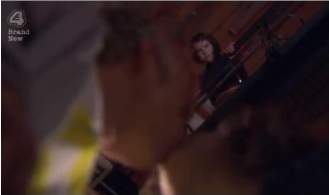
Shot 14, 04:52