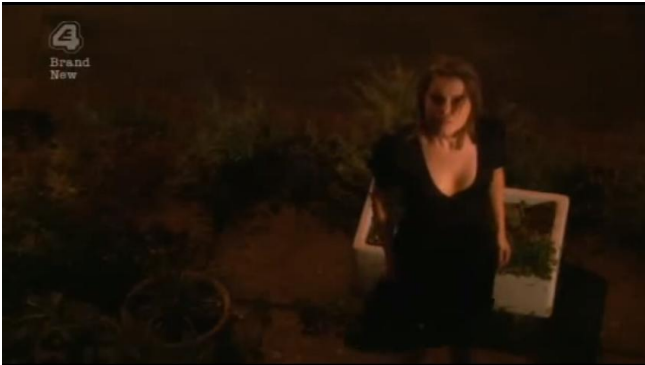
Shot 5, 44:05