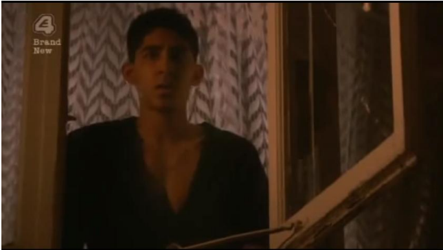
Shot 12, 44:25