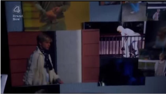
Shot 12, 02:09