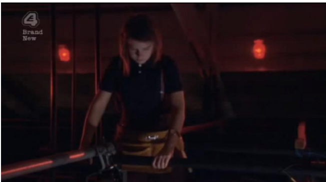
Shot 17, 05:01