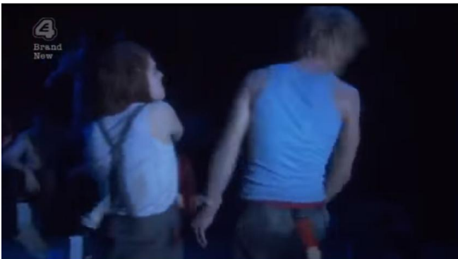
Shot 15, 41:32