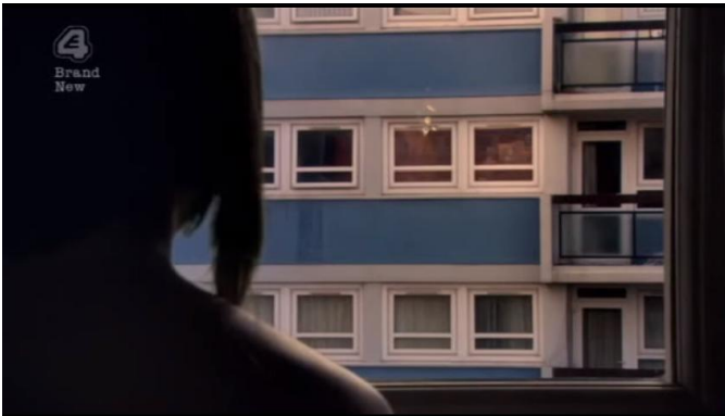
Shot 5, 01:33