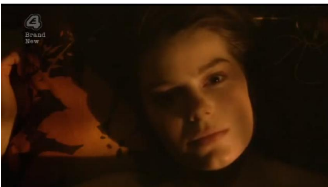
Shot 9, 45:44