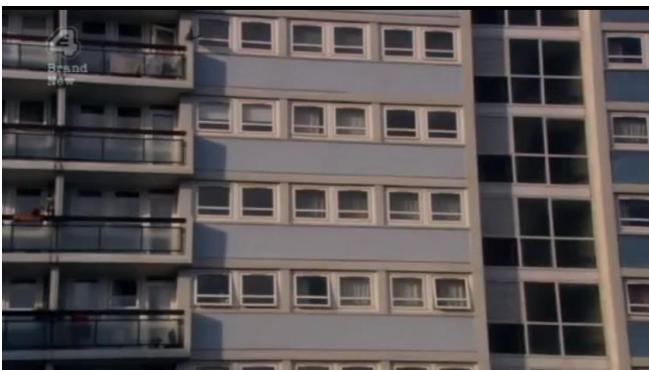
Shot 25, 02:52