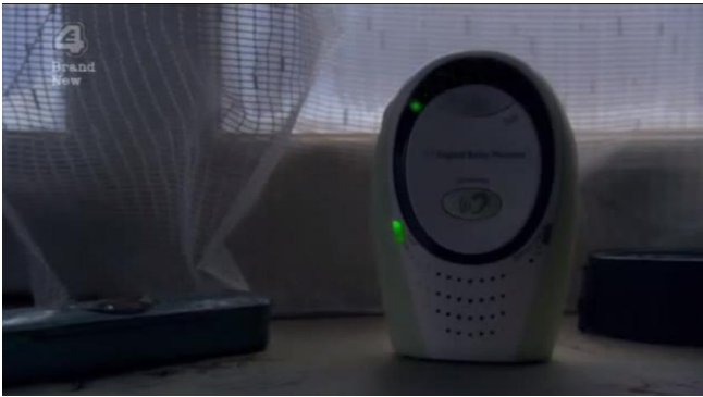
Shot 19, 02:30