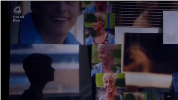
Shot 9, 01:58