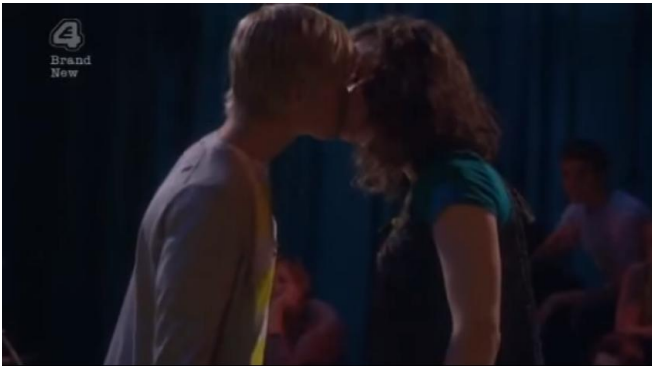
Shot 13, 04:50