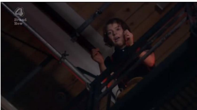
Shot 59, 07:53