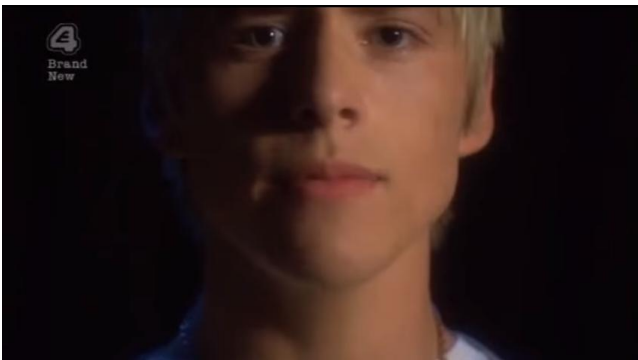
Shot 7, 04:28