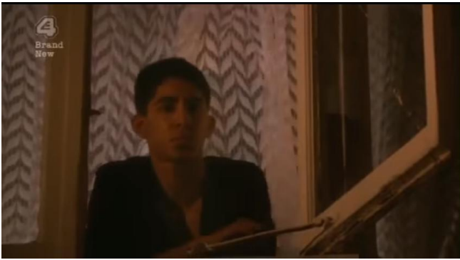
Shot 8, 44:11