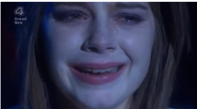
Shot 18, 41:50