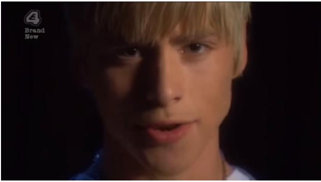
Shot 9, 04:37