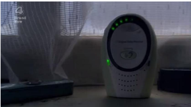
Shot 21, 02:39