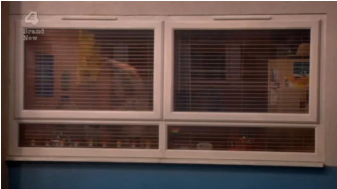
Shot 6, 01:39