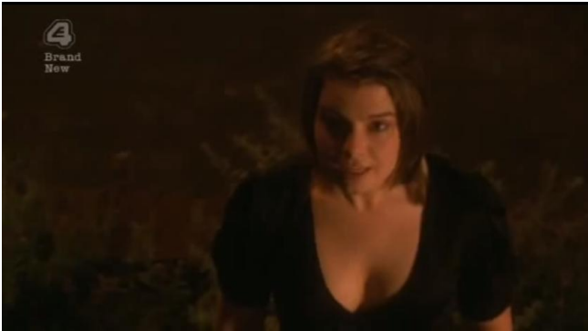
Shot 13, 44:29