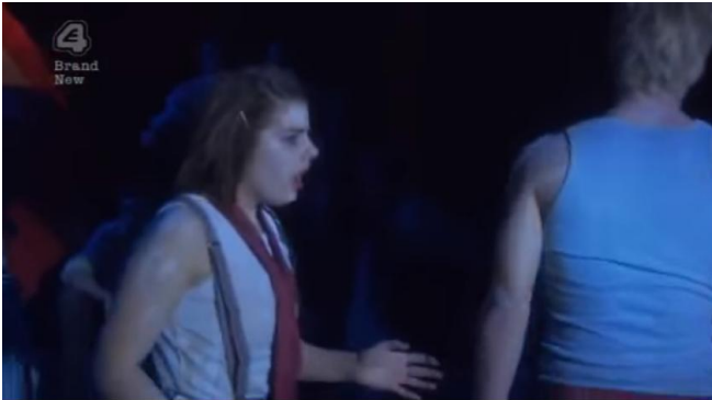
Shot 15, 41:30