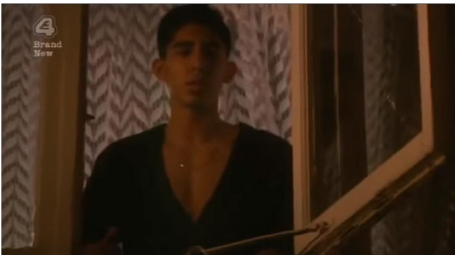
Shot 10, 44:16