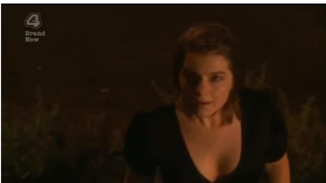
Shot 3, 43:59