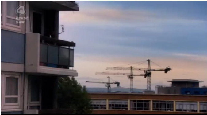
Shot 2, 01:25