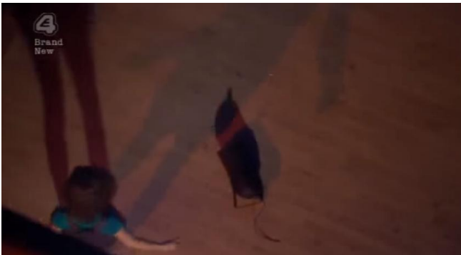
Shot 55, 07:47