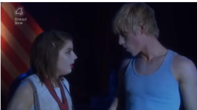
Shot 9, 40:52