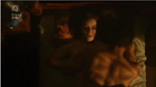
Shot 5, 45:03