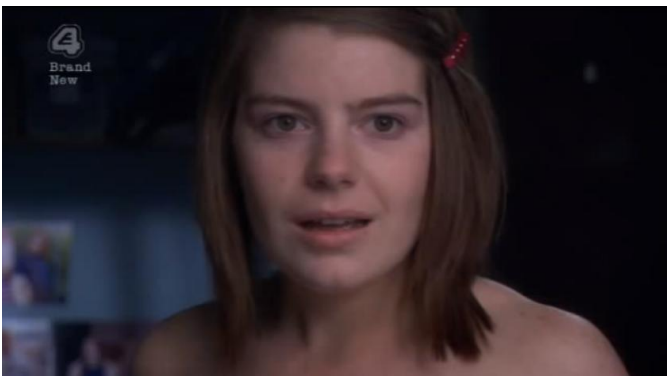
Shot 7, 01:45