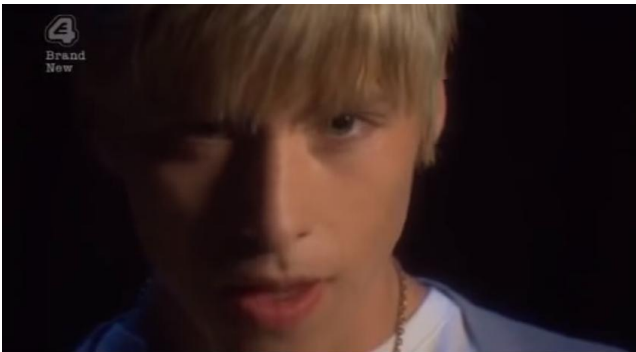
Shot 3, 04:01