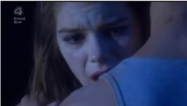
Shot 14, 41:28