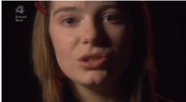
Shot 6, 04:13