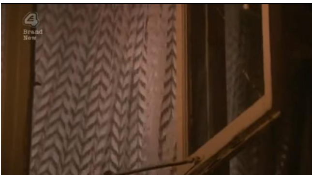
Shot 14, 44:33