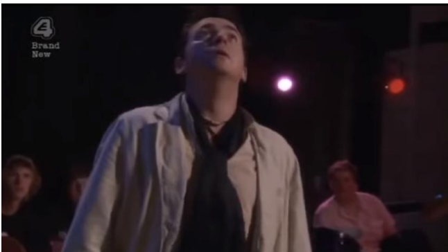
Shot 56, 07:48