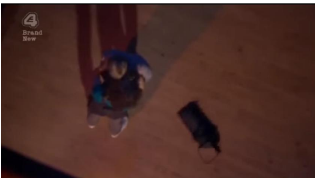
Shot 51, 07:43