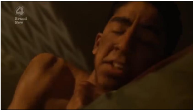
Shot 4, 44:51