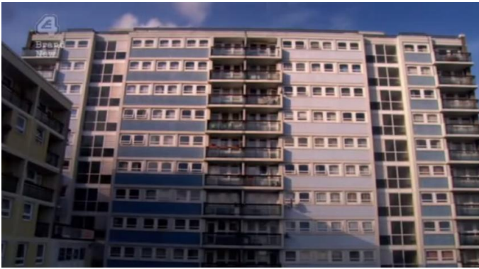
Shot 1, 01:20