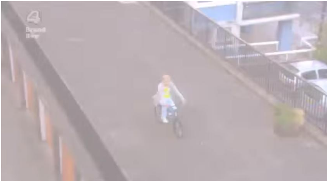
Shot 24, 02:48