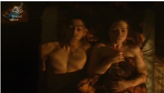
Shot 1, 44:38