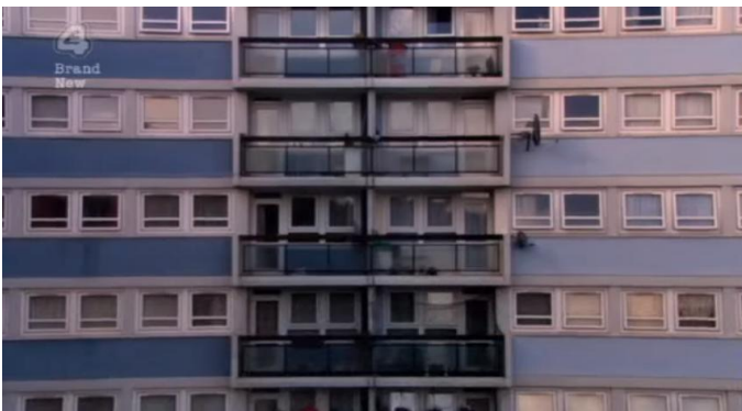
Shot 3, 01:28