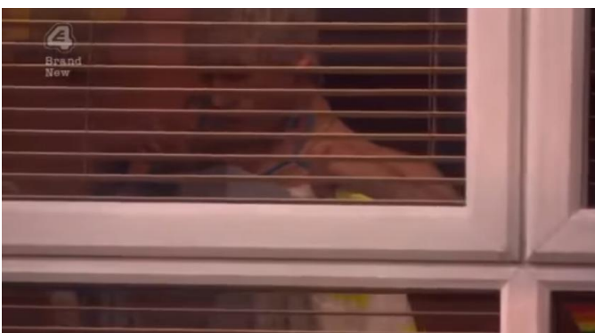
Shot 11, 02:09