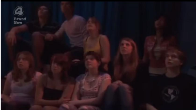
Shot 58, 07:52