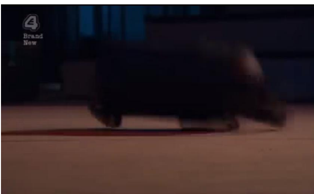
Shot 52, 07:44