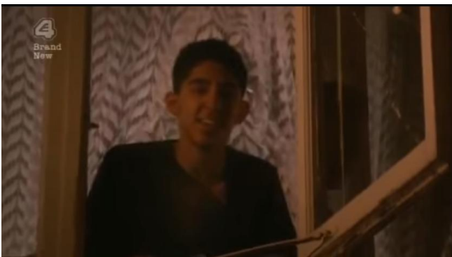
Shot 6, 44:07