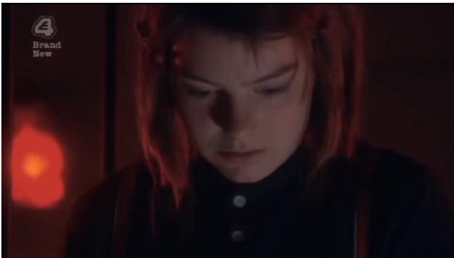
Shot 61, 08:03