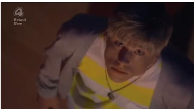
Shot 60, 07:59