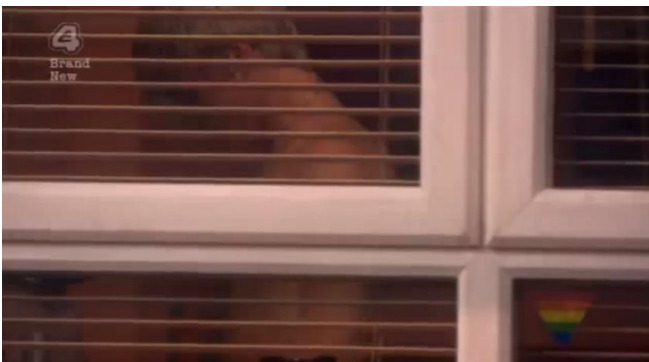
Shot 13, 02:20