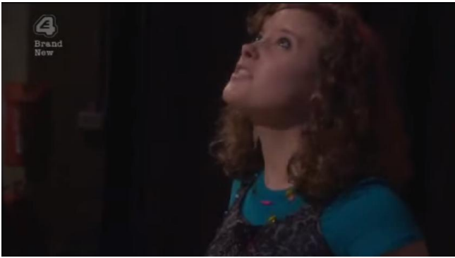
Shot 57, 07:49