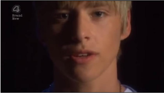
Shot 1, 03:50