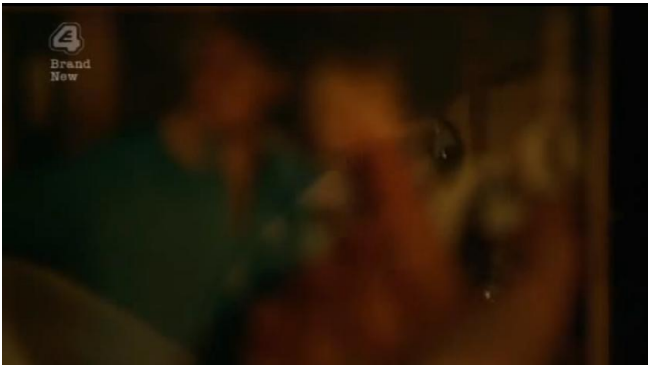
Shot 8, 45:32