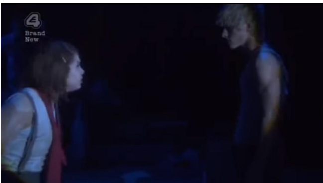
Shot 15, 41:35