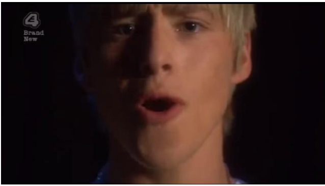
Shot 5, 04:09