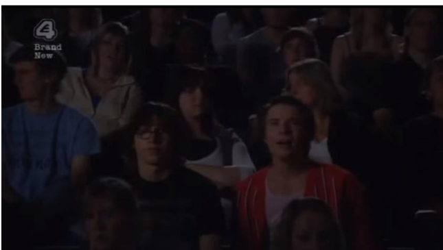
Shot 19, 41:55