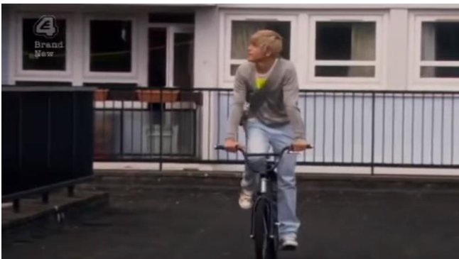
Shot 22, 02:42