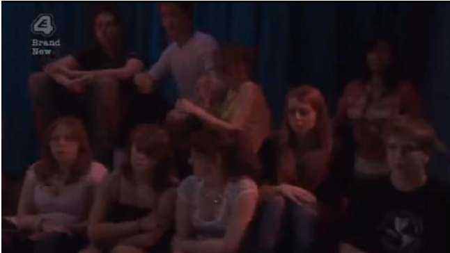
Shot 54, 07:46