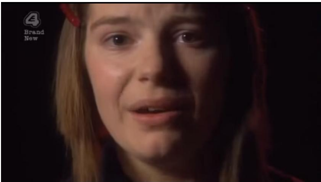
Shot 2, 03:54