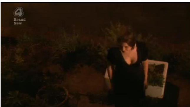
Shot 15, 44:33