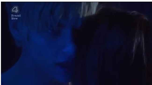
Shot 13, 41:25