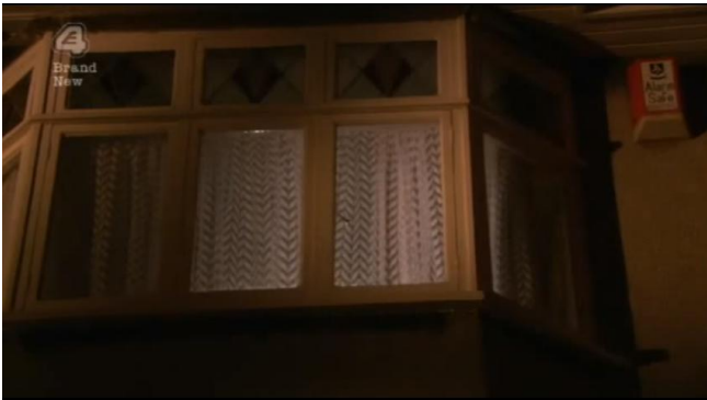
Shot 1, 43:52