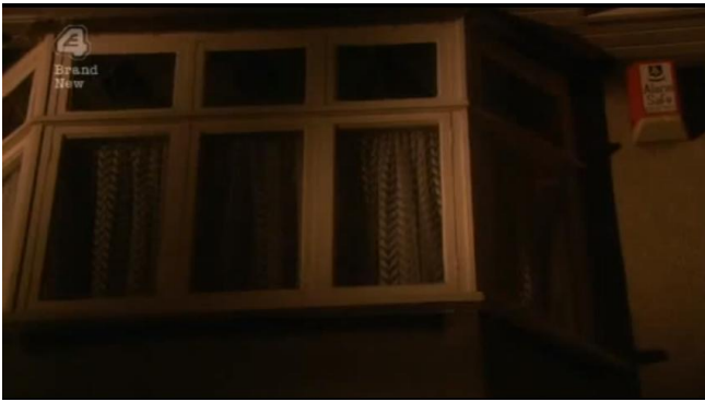
Shot 1, 43:49