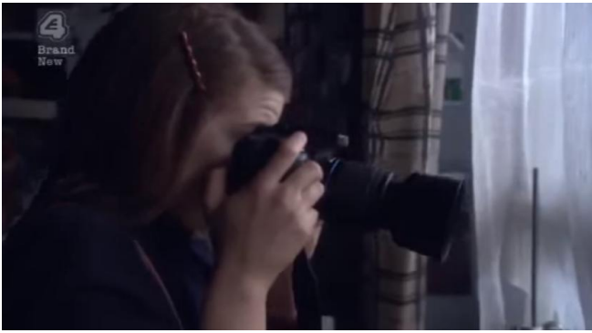
Shot 23, 02:45