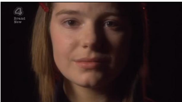
Shot 4, 04:06