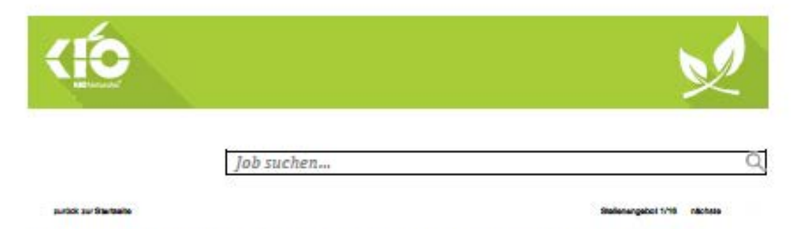
Figure A3: Recruitment ad, German CSR condition