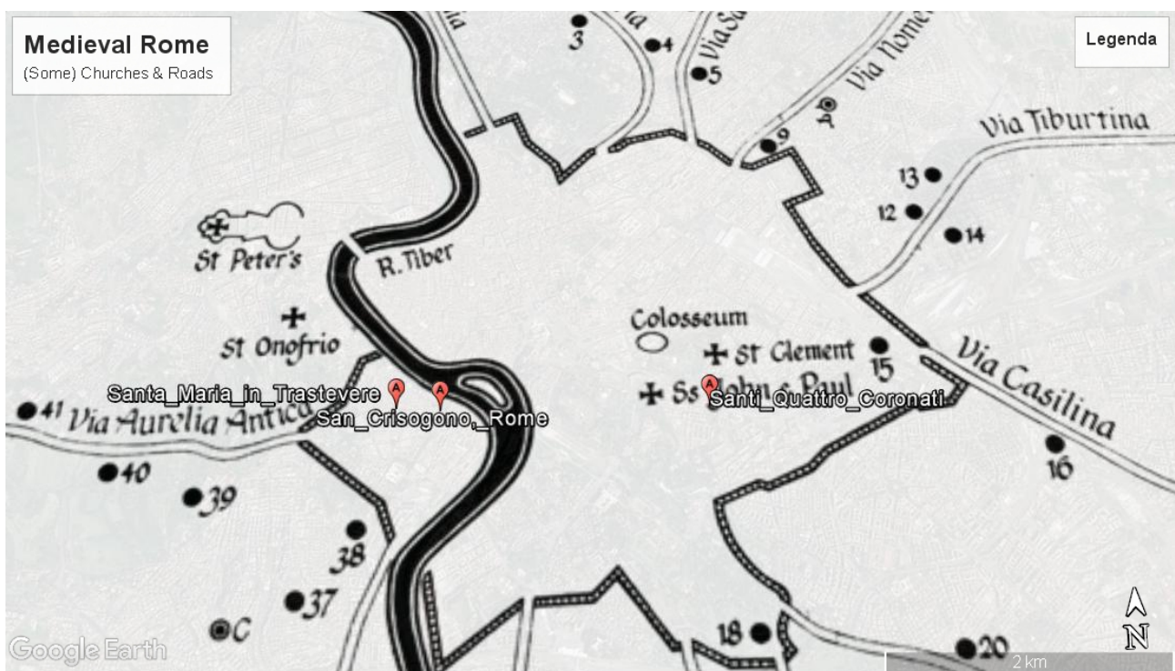
Figure 4: Map of medieval Rome - Focus on the churches

As a conclusion to this chapter I will answer the subquestion I have posed at the beginning of the chapter: How was liturgical ceremonial able to contribute to papal power? The answer is twofold: symbolism and Rome's landscape. The symbolism of the adventus as imperial and christian meant that any time a pope performed an adventus , the ritual would (try to) invoke these symbolisms in the audience. This was strengthened by Rome's landscape on the one hand, that would emphasise the power of the church and the papacy due to the juxtaposition of the ancient ruins and its imposing churches, through which the pope went on his way to either St. Peter's or the Lateran basilica. And on the other hand amplified by the use of imperial insignia.