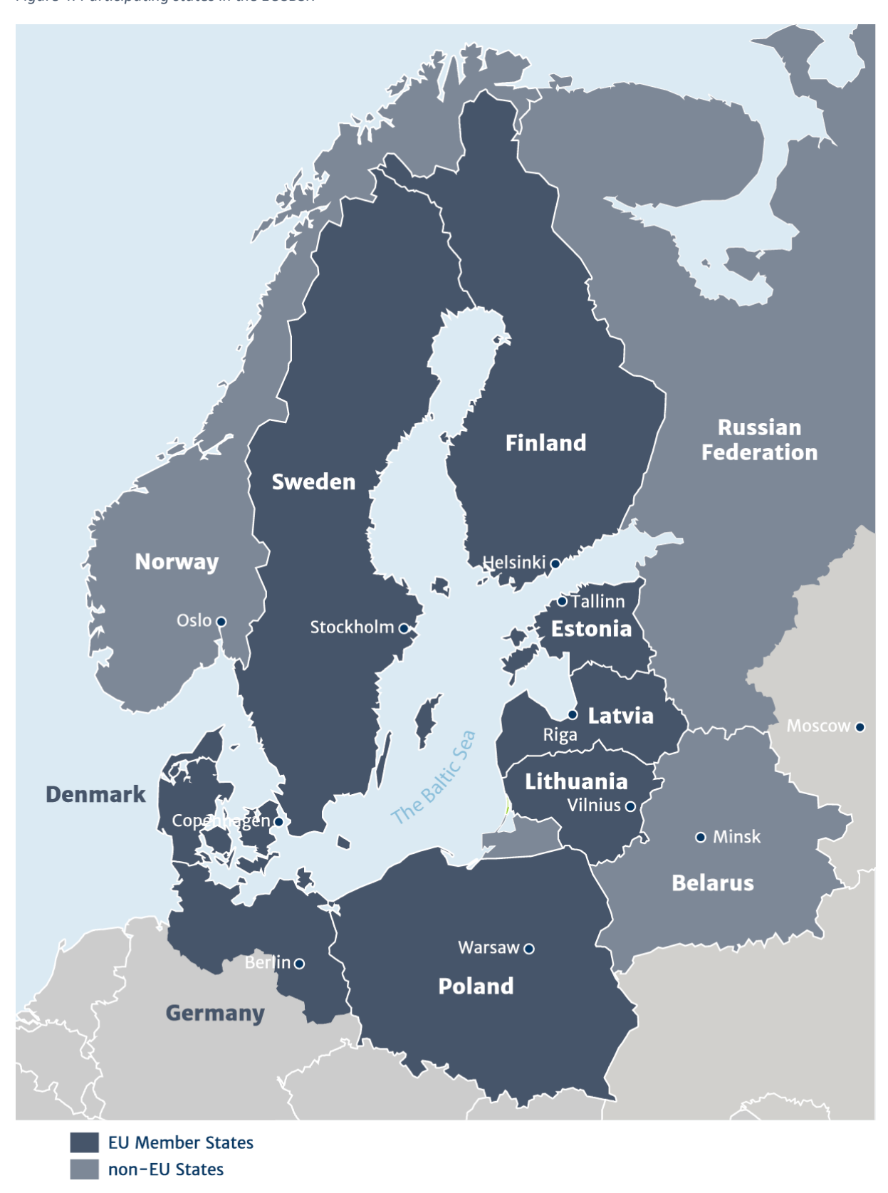
Figure 4: Participating states in the EUSBSR