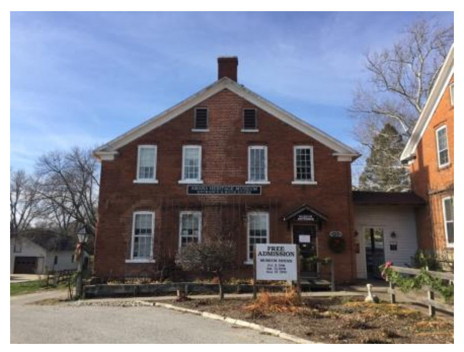
Fig. 5. Synofzick, Marie. "Amana Heritage Museum." 2016. JPEG file.