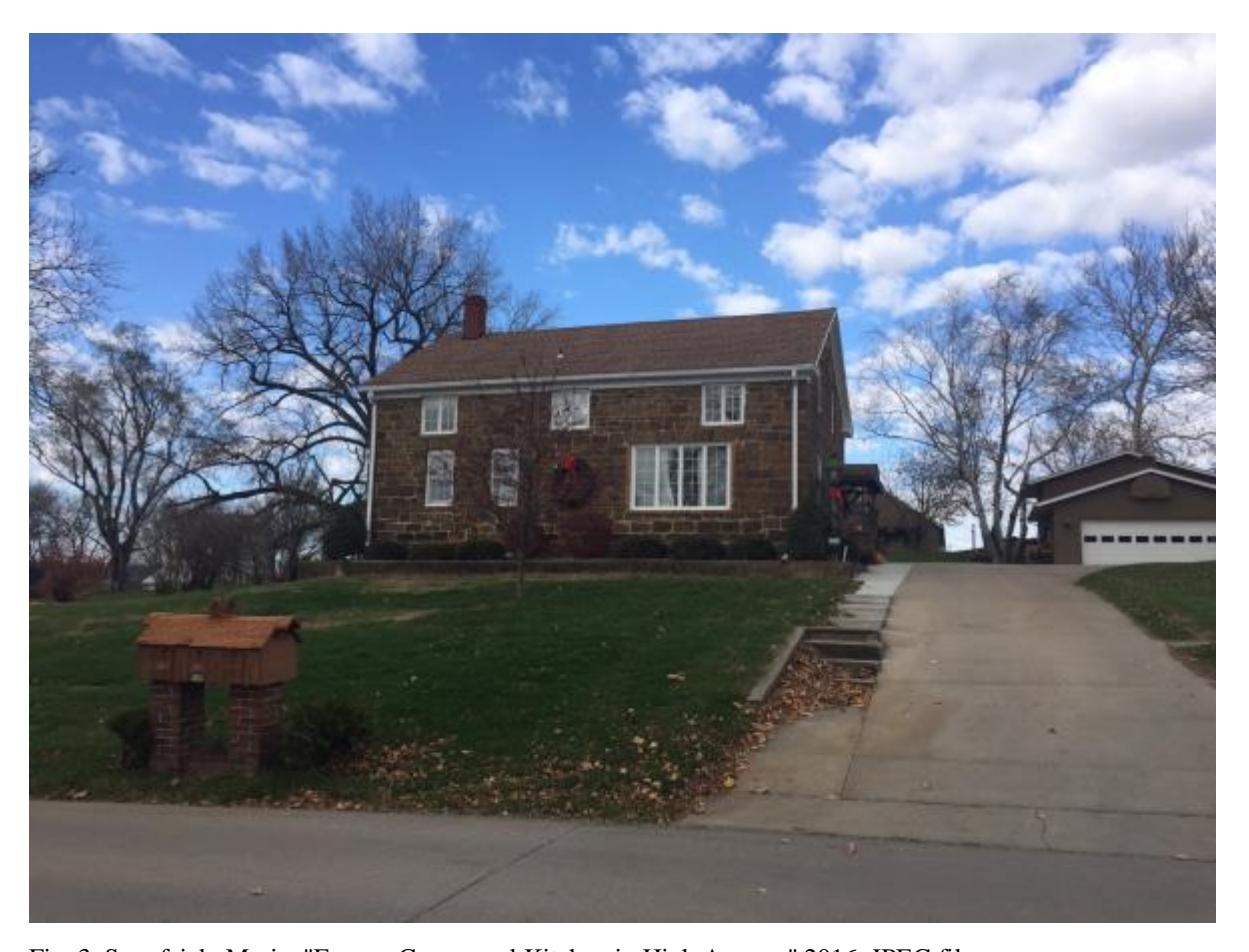
Fig. 3. "Former Communal Kitchen in High Amana." 2016. JPEG file.

The German language which had always influenced everyday life in Amana and which had survived so long, began to deteriorate among members slowly after the Change, but especially quickly during the years of the Second World War. Amana members "discouraged the speaking of the German language" in order to show their loyalty to their homeland: America (69). However, German was still the prevalent language at home in the colonies and everyday life was regulated in the language of the old homeland. One might argue that migration and acculturation did not happen until 1932 and the following years altogether, since the community did not change shape from its origins in Germany. Communal living had been established in European living quarters, long before the group left for America. In this light, only after disembarking from this lifestyle were the Amana people forced to interact with and adapt to American society. Before their community shielded itself from external influences, and was not penetrated by American culture. It is therefore especially interesting to look at more recent developments in peoples' identities, which will be done through personal interviews.