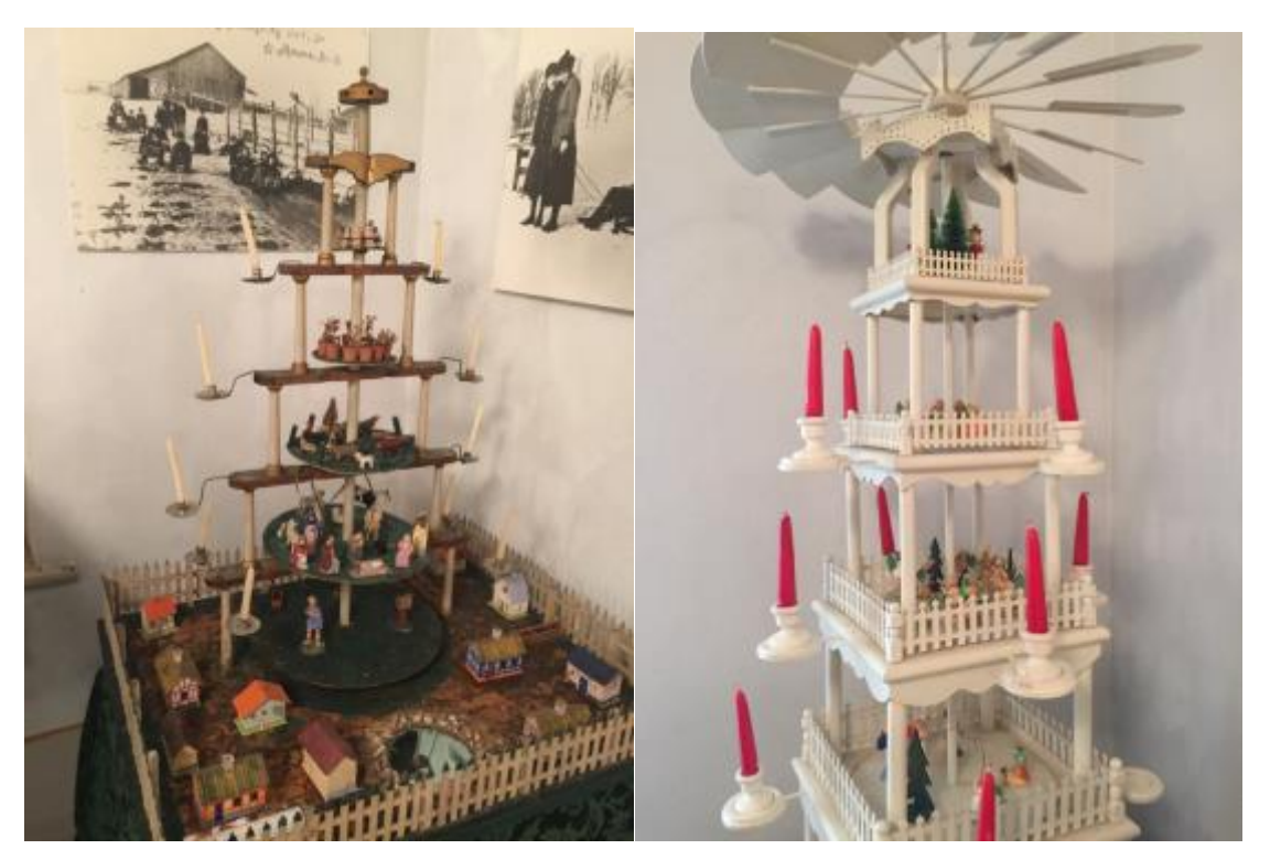
Fig. 8. Synofzick, Marie. "Christmas Pyramid I." 2016. JPEG file. \,