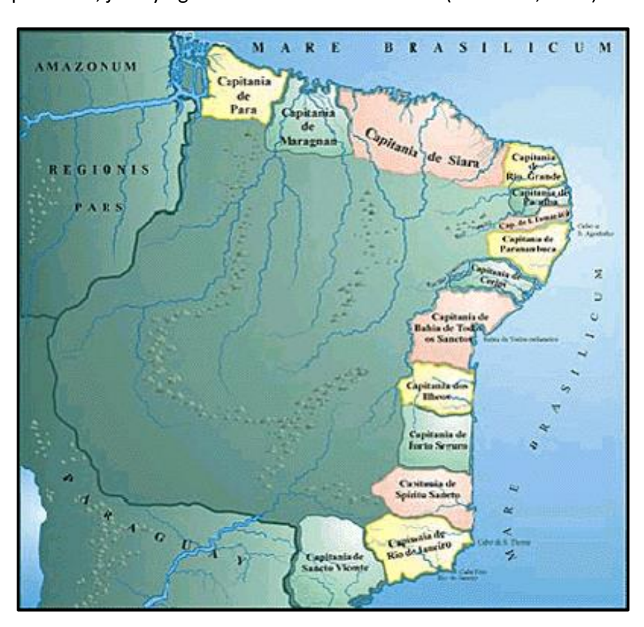
Picture 2: Brazilian Hereditary Captaincies

At the beginning of colonization, the population was restricted to the coast, developing economic activities with extractive characteristics. Later it started the cultivation of sugar cane and the installation of mills, especially on the northern coast. This production was directed to exportation, justifying the choice for coastal areas (Pessanha, 2005).