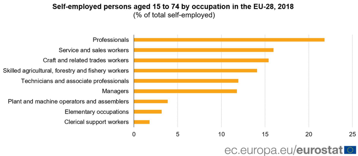
Figure 1. self-employed workers divided by profession (Eurostat, 2019).

There seems to be a tension in the literature between cultural voting and class voting. This tension might not only exist in the literature, but also in real life. One group might become self-employed in order to find opportunities for responsibility and profit, where other self-employed workers seek autonomy in order to avoid working for a boss or be a small entity in a big company. Research has been done on self-employed workers and the group seems to be very different from the classic idea of a self-employed worker. There is evidence that self-employed workers are not a homogenous group, but that there is a divide in the self-employed worker class. Autonomy might be an explanation for this divide (Jansen, 2017). On one hand, one group of the self-employed workers strives for profit and responsibility, making them more likely to vote for right-wing parties. On the other hand, another group seeks autonomy from bosses and big corporations, seeing autonomy as a form of personal freedom which is associated with post-materialism (Inglehart, 1991). Research has shown that autonomy is an important reason as to why people start their own business or become self-employed (Gelderen en Jansen, 2006; Taylor, 1996).