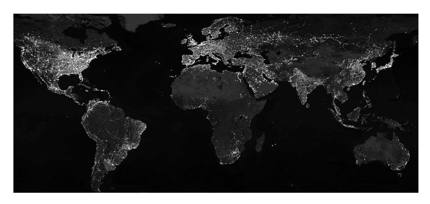
fig 1: NASA Earth Observatory – City Lights 2012