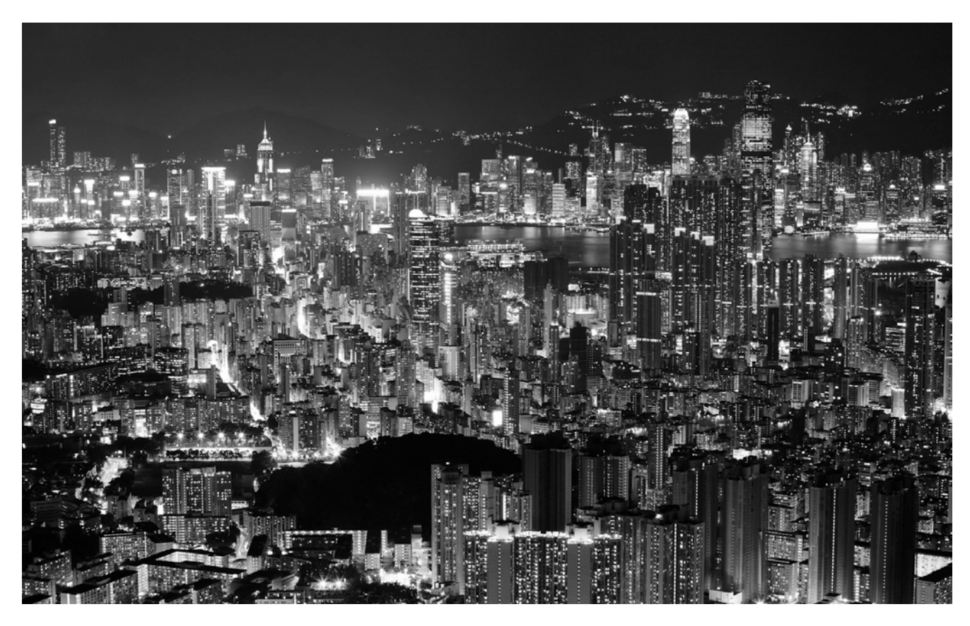
fig 2: Compilation – modern metropoles at night

Now, what does this constellation suggest with regard to homogenization and modernity? Are these images, simply put, representations of places or non-places? Do they embody diversity or the contrary? Do they imply local, that is cultural and historical, embeddedness? The initial question is thus how the illustrated global delocalization comes about. If we assume that in a "post-colonial world" the (spatial) practices giving rise to homogeneity in question are not the result of imperial authority and domination, then how can they be explained? Are they rather a matter of hegemony, that is of knowledge and subjectivity ?