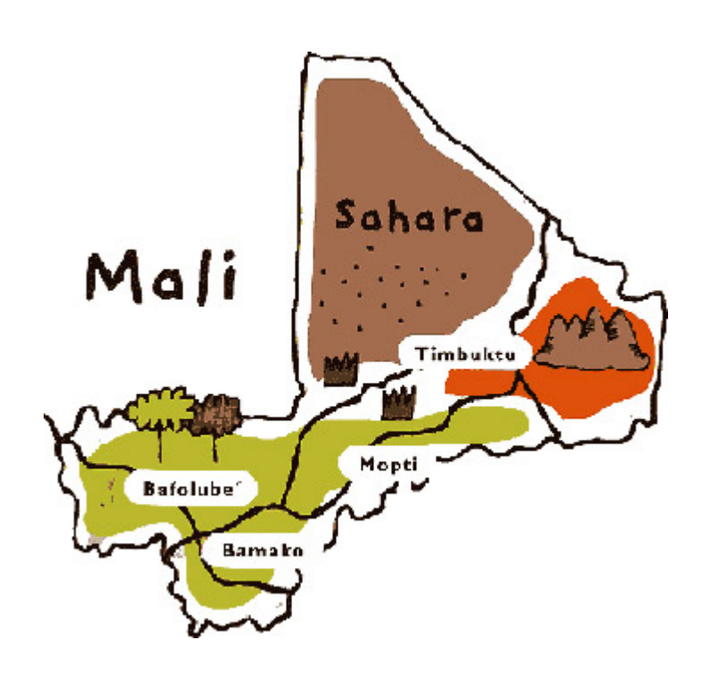
Map of Mali<sup>3</sup>