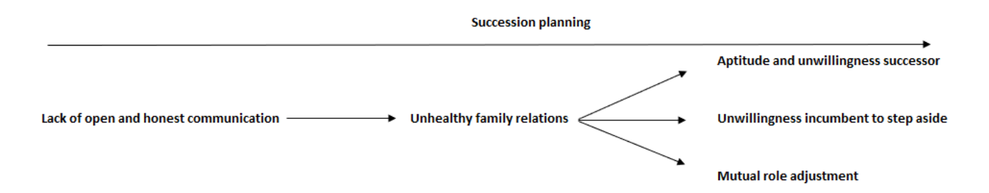
Figure 3. Order of the six bottlenecks of a succession process.

a team effort. Furthermore, it is useful in keeping pace of the succession process by showing what the next steps are and when it is time for the incumbent to adjust his role or to actually step down as the company leader. The order of importance concerning the six bottlenecks during a FB succession process are illustrated in figure 3.