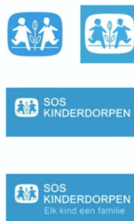
Figure 2. Dutch logo SOS Children's Village (SOS Kinderdorpen, n.d.)