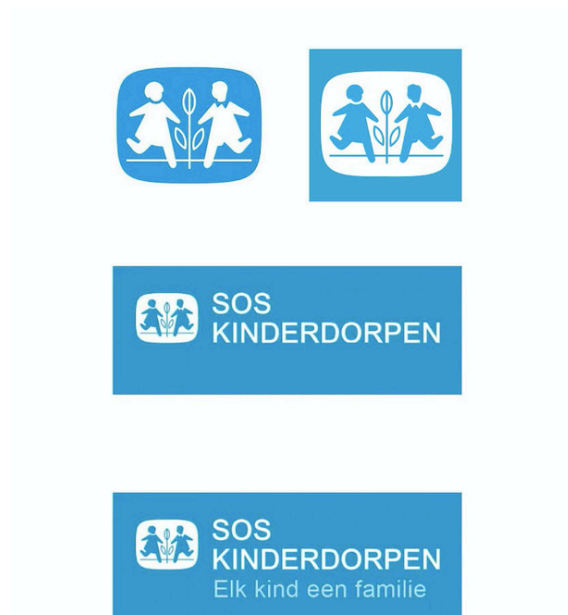
Figure 2. Dutch logo SOS Children's Village (SOS Kinderdorpen, n.d.)