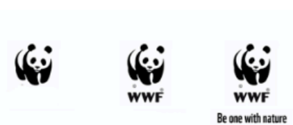
Figure 4. Dutch Logo World Wildlife Fund (World Wildlife Fund, n.d.)