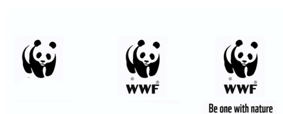
Figure 4. Dutch Logo World Wildlife Fund (World Wildlife Fund, n.d.)