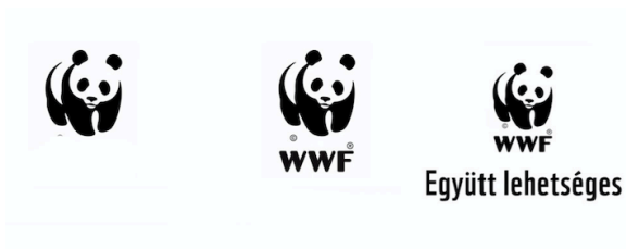
Figure 3. Hungarian Logo World Wildlife Fund (World Wildlife Fund, n.d.)