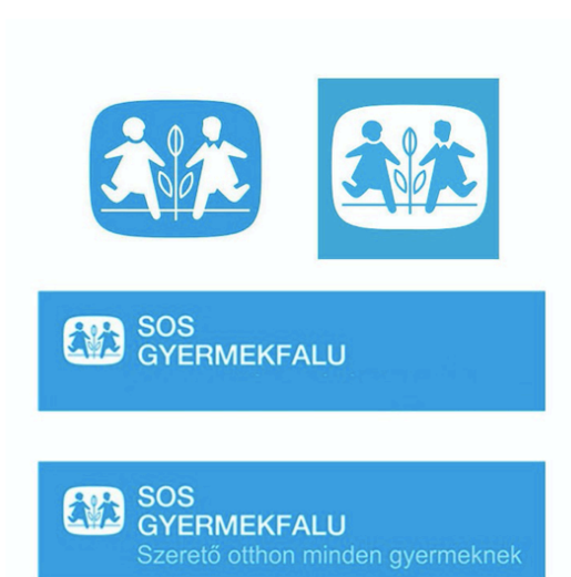
Figure 1. Hungarian Logo SOS Children's Village (SOS Gyermekfalvak Magyarország, n.d.)