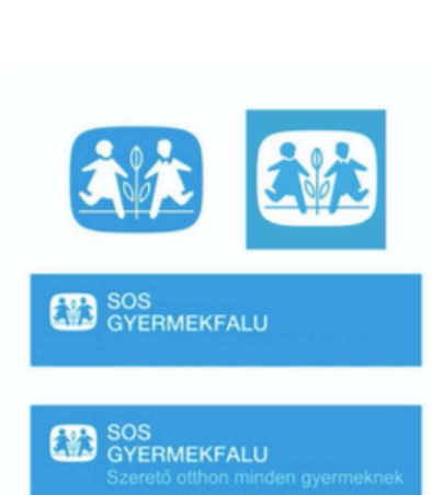
Figure 1. Hungarian Logo SOS Children's Village (SOS Gyermekfalvak Magyarország, n.d.)