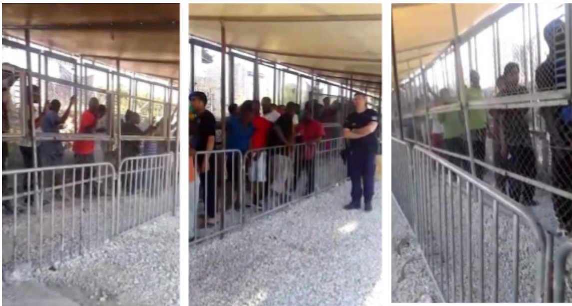
Fig. 12: Lining up for food distribution in Moria camp. (H. 2017)

The long food queues result in the fact that people are waiting in line for a big part of the day. The conditions in which people have to wait for food are absolutely dehumanizing(Fig. 12). Standing in line in between fences, guarded by police, like animals in a cage. Also children are waiting in this line for food.