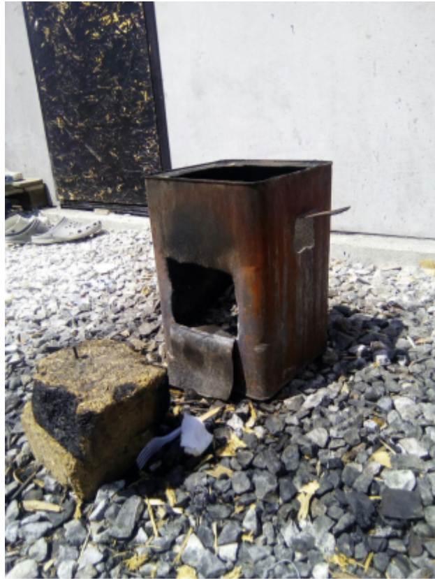
Fig. 13: A makeshift 'kitchen' in Moria camp (Heinig, 2017)

Other residents tell that they have been punished for cooking inside Moria. However, going outside the camp to cook is also not an option because police does not allow residents of the camp to hang out outside of the camp (except for near the entrance of the camp). F. says: "Police beat me because they say: why you make food inside Moria? with fire inside Moria..? I say I don't like your food so I make it for myself.. but then again they say: never make food inside! If you don't eat the food here I don't care but don't make inside. So then I go outside to make food but then again they make more problem that i'm outside. They say: Why you go outside? you go inside!" (F.). Inside the camp the police also regularly checks the tents of the residents: