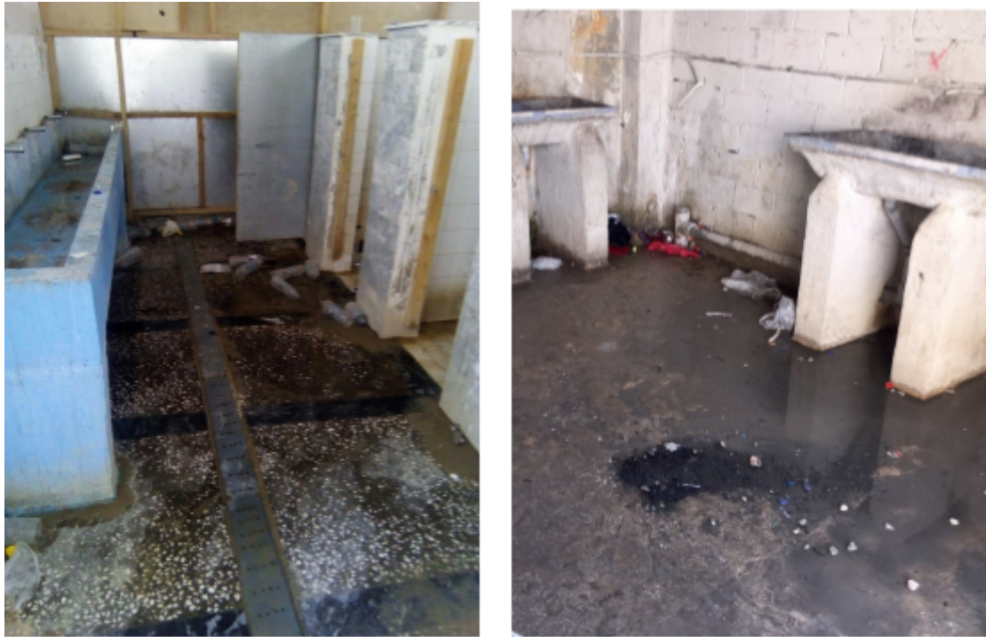
Fig. 11: filthy bathroom facility in Moria camp. (H. 2017 & Lesbos Solidarity, 2017)