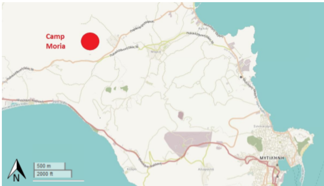
Fig. 3 :Zoomed in map of Lesbos showing the Mytilini area. In the southeast you can see Lesbos's capital Mytilini. The red dot indicates the location of Moria camp (Openstreetmap contributors, 2017)

The camp has high walls and fences all around. Multiple rows of Razor wire decorate these walls. From how the camp looks, you would start to think that those inside must have done something wrong. There is one entrance where residents can enter, it's guarded by two greek police officers. The security is strict, and will check