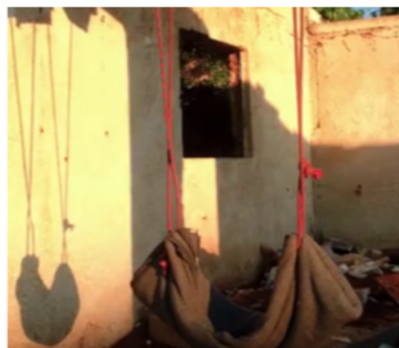
Fig. 15: Out and inside of the 'old squat'.