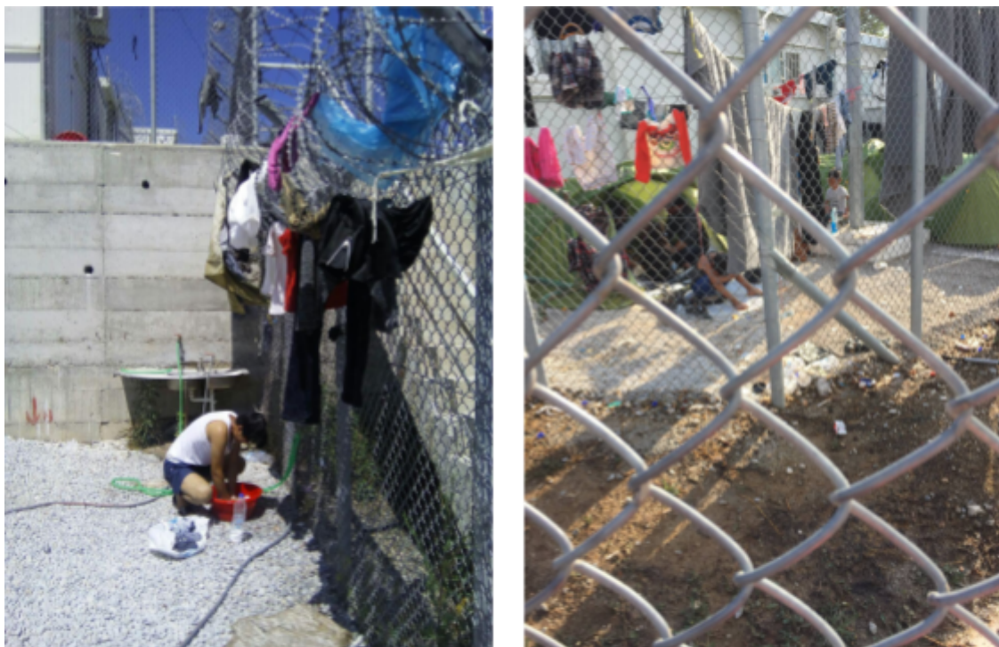
Fig. 5: Razor wired fence segregating two sections in Moria. In the left image the razor wire is used to dry wet clothes on.

Inside the camp, the Asylum office is located. The greek asylum office, supported by the EASO( the European asylum support office) has a double fence around it. 5 rows of razor wire wind up and in between this fence. A 'sluice' in the fence is guarded. A row of around 15 people is waiting for their appointment in front of the sluice(Figure 6). When one person's leaves the facility, the guard lets one other person go in. The people in this cue have been waiting long very their interview, sometimes more than a year.