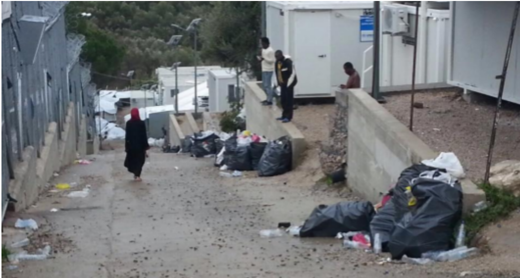
Fig 8: Different levels in camp Moria ( Lesvos solidarity, November 2017)