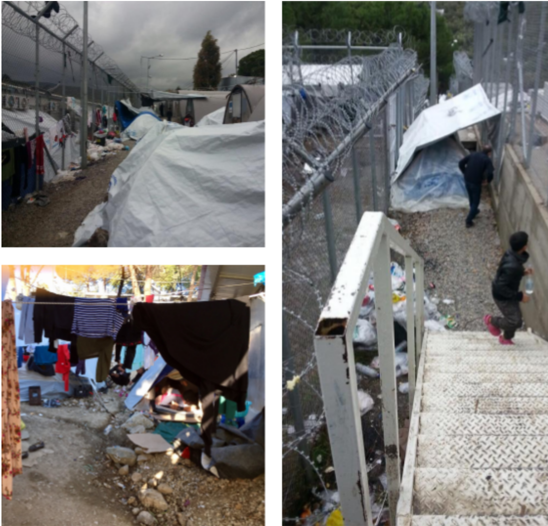
Fig.10: Makeshift shelters and 'Camping' tents in between other housing facilities in camp Moria. (Lesvos solidarity, November 2017)

While there is a difference in quality of the housing facilities, they are all similar in being heavily overcrowded. Being cramped up together in a small space for months or years, whether that is in a tent or a container, has turned out to be a dehumanizing experience for all those I spoke to. "There is nothing good in Moria. (...)You have to be there to understand what i am saying. We came from our country and now we are in a place with 15 languages, its very hard. You cannot understand people, you cannot speak with them. It's exactly like a prison. When you wake up in the morning. You think you are in a prison.. Its very hard. (...)We was living in a small tent in Moria. Not even a container. It was raining and snowing. It was very hard. No it's not good with 30 person with 3000 dreams. You must put your headphones on your head and finish your time everyday(...) Now it is a little bit better than the past. But we have problems even now. After fire in the camp, after people who dies. They think they have to bring people to more