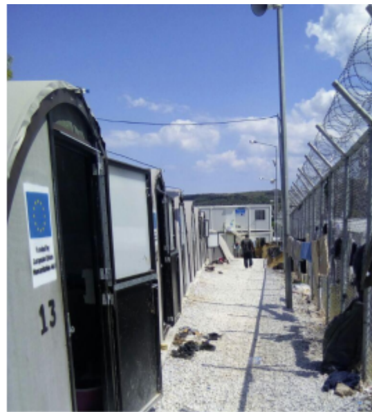
Fig. 9: Rows of tubular tents in Camp moria. (H. 2017)