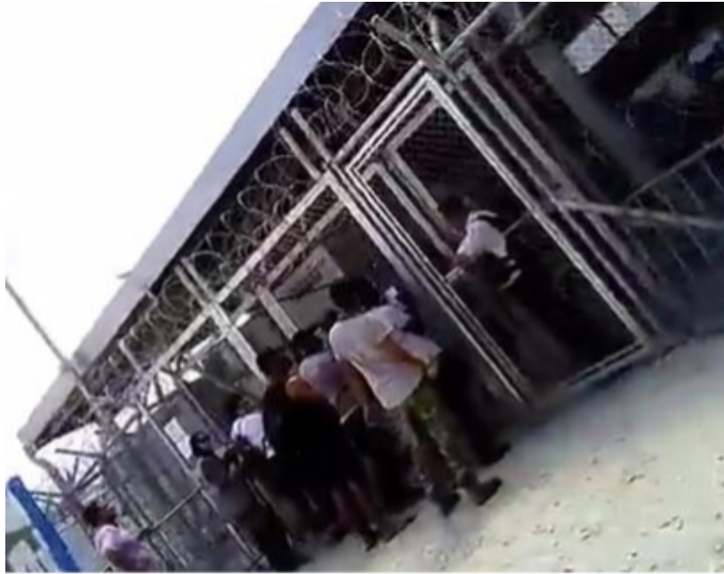
Fig. 6: People waiting to enter the asylum office area in front of the guarded 'sluice'. (H. 2017)

Me and my camp 'guide' continue our walk through the camp. I ask him if that building with that particularly high fence around it is maybe the entrance of the detention center in the camp, he answers - to my surprise - that the building we are looking at is the 'first reception center' (Fig.7). The place is a big tent where new arrivals on the island are placed and detained for a minimum of 2 days. Erfan explained to me how also he was surprised by all the fence: "when we arrived in Moria.. first we saw a lot of fence.. i really hate fence. it's so big.. why does Europe put refugees inside the fence? Inside this fence?" . Inside this fence new arrivals are registered, medically checked, fingerprinted and provided with some basic needs like food and blankets. At the the fence of this reception center, I see two people I assume to be lovers holding hands through the fence, crying. One of them just survived the dangerous sea crossing from Turkey to Lesvos, now still separated by this fence.