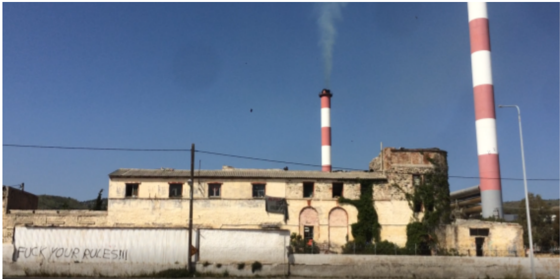
Fig.14: The old squat next to the Lesvos Powerplant. (Photograph by author, May 2017)