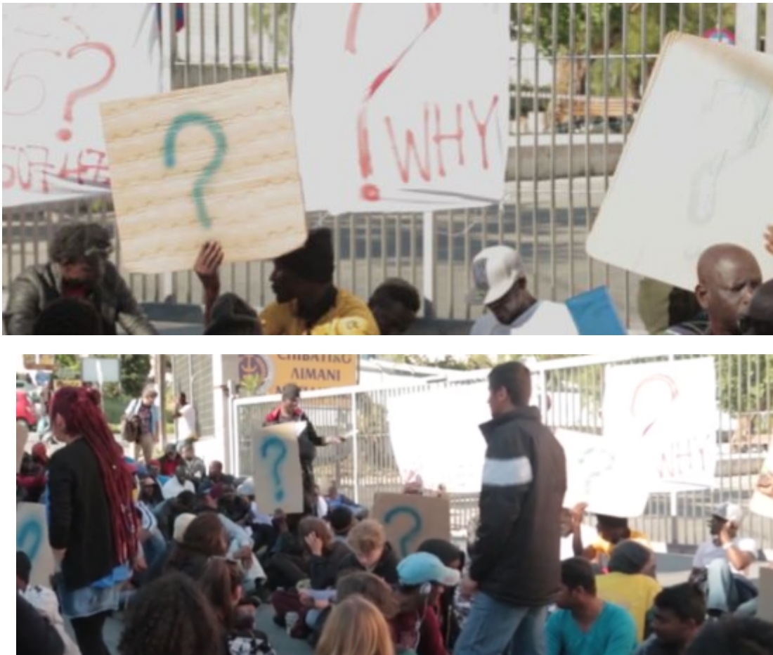
Fig 16: Protesters blocking the gates of the ferry port