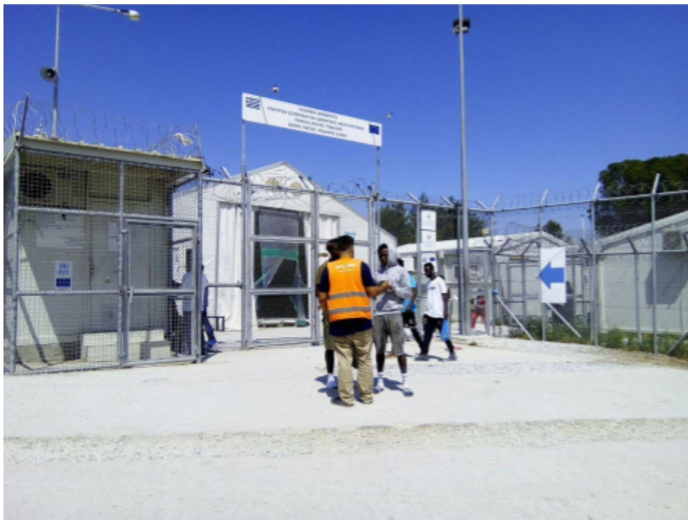
Fig. 7: Fenced entrance of 'first reception center'. (H. 2017)

Next to the First reception center, unaccompanied minor are detained in a detention facility for minors. Unaccompanied minors are detained in a separate part of the camp upon arrival - 'for their own protection'-. I somehow expected it be a more welcoming or friendly place, but again, the razor wired fence also dominates this picture. Unaccompanied minors are officially regarded as vulnerable and have the right to protection. There is a program that locates unaccompanied minor to shelters on the mainland of Greece. However, with only 1223 places in specialized shelters for minors and around double that amount of unaccompanied minors in Greece(Pro asyl, July 2017), hundreds of them are stuck in detention facilities. The prospect of being detained makes many minors lie about their age when they are registered. Something that often negatively influences their future asylum process because it makes their 'files' inconsistent.