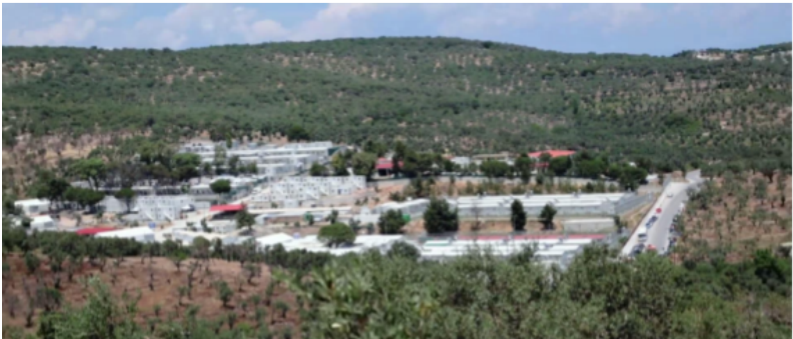
Fig 4: Camp Moria from a distance. ( Heinig, 2017)

The camp consist of different sections with 'housing facilities', some of those sections are separated from each other by a razor wired double fence(figure 5). To enter a section residents need to show their wristband to Euro Relief volunteers sitting at the section gate. Erfan, a 26 year old afghan man who has been on Lesbos since april 2016 explains: "we have a wristband that shows our number, that we live in that tent on that level and everytime we want to go inside and go out, we have to show that wristband to them" . Each section has their own wristband. Nationalities are segregated by these sections, although some 'groups' (like Africans), are put together by this racialized divide.