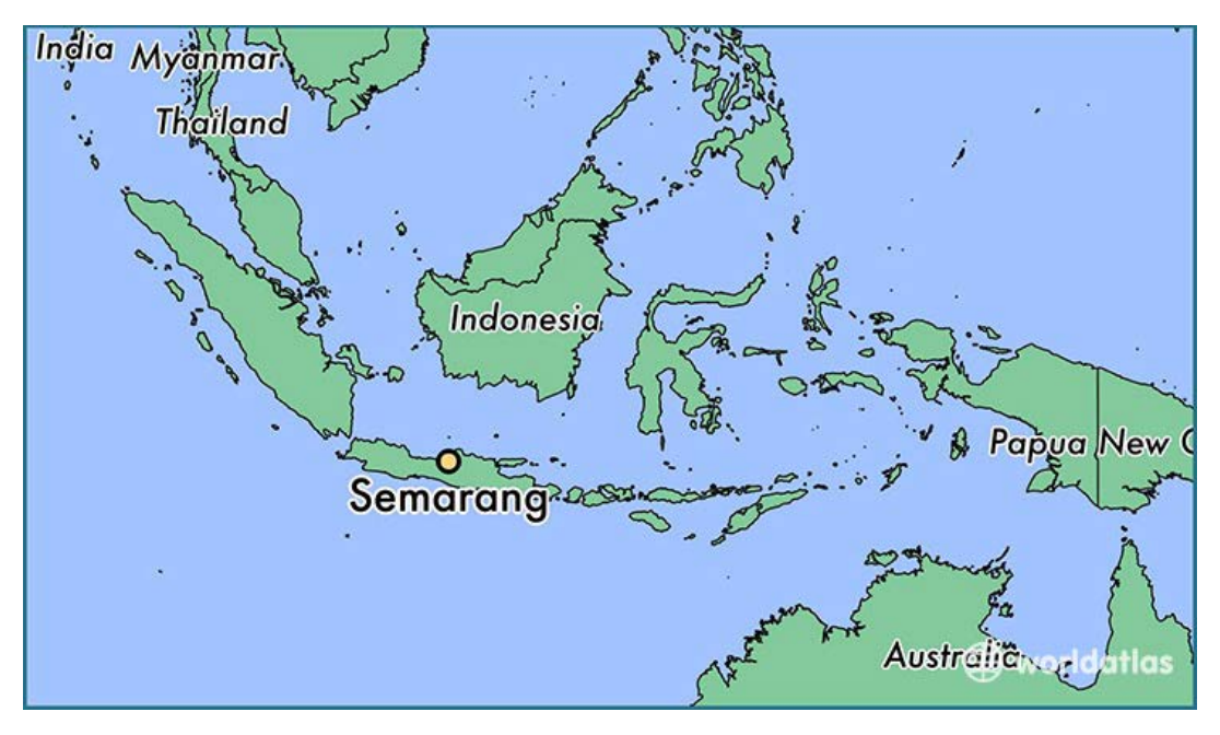
Figure 1 Map of Indonesia.

Brain drain is a concept which is known over the entire world. It means that higher educated people move from a developing country towards a more developed country. This research is about the concept of brain drain in the specific city of Semarang on the island of Java in Indonesia. Indonesia is a developing country with several important cities, with Jakarta as its capital. Figure 1 shows where Semarang is located on the island of Java in Indonesia.