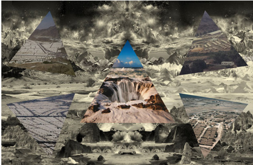
Fig. 5. The End of Now by Jess Littlewood from "Geometries of Utopian Desire." Notes on Metamodernism , 8 Dec. 2012, www.metamodernism.com/2012/11/08/geometries-of-utopian-desire/ .