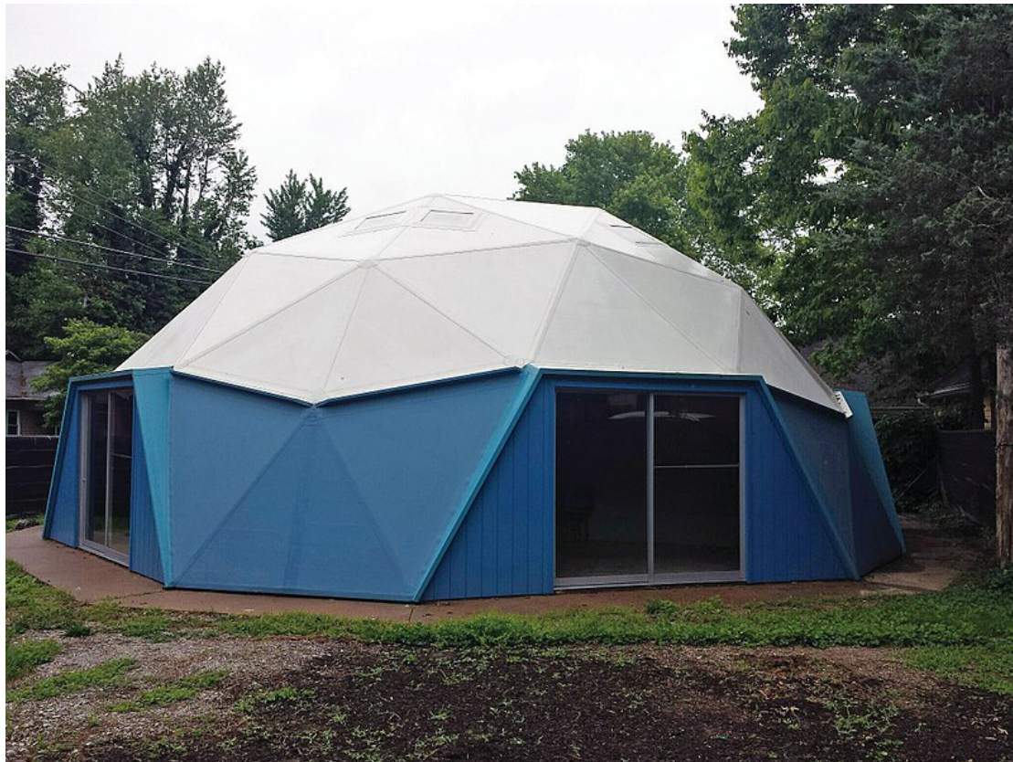
Fig. 4 Fuller's dome embodied in his home in Carbondale, USA by Fuller, R. Buckminster from Wikimedia Commons , 16 July 2015, commons.wikimedia.org/wiki/File:Preserved_R_Buckminster_Fuller_and_Anne_Hewlitt_Dome_Home.jpg .