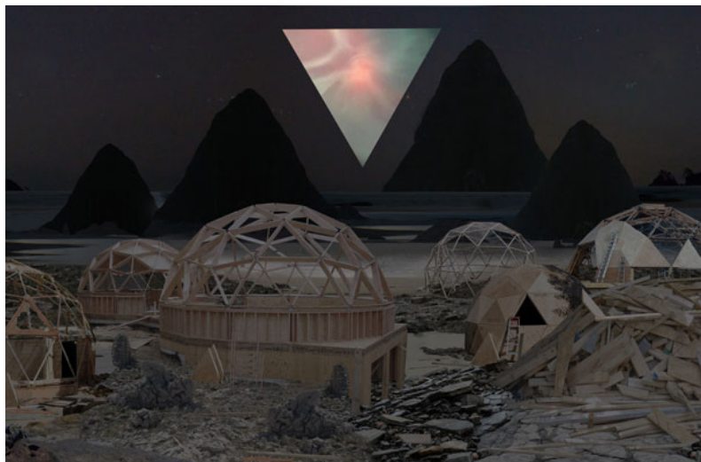
Fig. 2. Commune by Jess Littlewood from "Geometries of Utopian Desire." Notes on Metamodernism , 8 Dec. 2012, www.metamodernism.com/2012/11/08/geometries-of-utopian-desire/ .