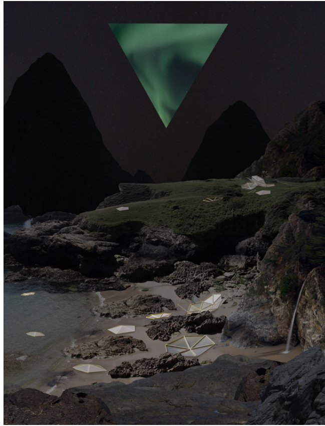
Fig. 1. Failure by Jess Littlewood from "Geometries of Utopian Desire." Notes on Metamodernism , 8 Dec. 2012, www.metamodernism.com/2012/11/08/geometries-of-utopian-desire/ .