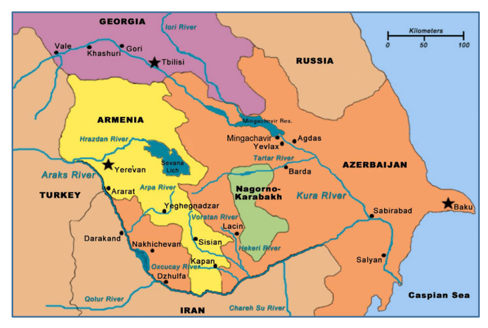
Figure 1: Map of the Caucasus region