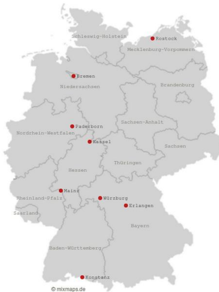
Figure 3: Geographical location of investigated WfH projects (adapted from mixmaps.de , 2018)