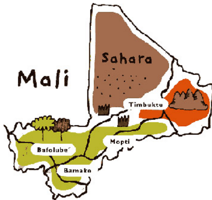
Map of Mali 3