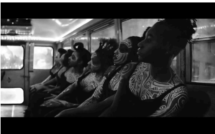
Picture 8: Black women with body paint on a school bus. Screenshot 00:16:26 ( Lemonade , Dir. Åkerlund et. al.)