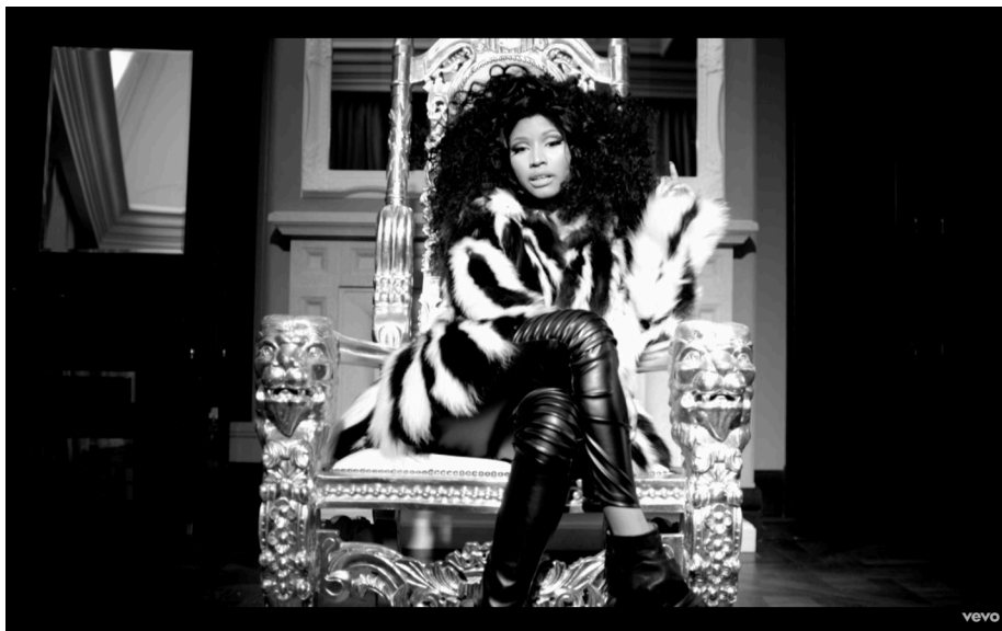
Picture 15: Nicki Minaj sitting on a throne, making her the queen of her empire. Screenshot 1:49 (“Nicki Minaj – Freedom”)