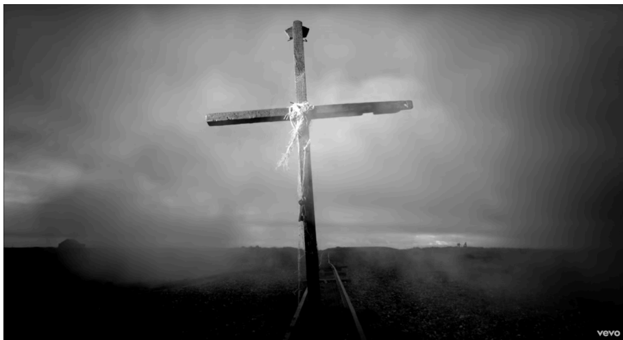
Picture 17: A cross with four large keys hanging from strings. Screenshot 0:18 (“Nicki Minaj – Freedom”)