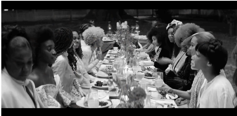
Picture 10: Women at a large table, all with different hairstyles. Screenshot 00:49:06 ( Lemonade , Dir. Åkerlund et. al.)