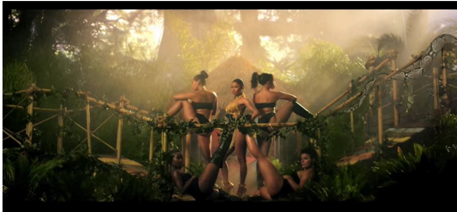
Picture 13: Opening shot of the music video “Anaconda” showing Nicki Minaj and four dancers posing on a bridge in the jungle. Screenshot 00:18 (“Nicki Minaj – Anaconda”)