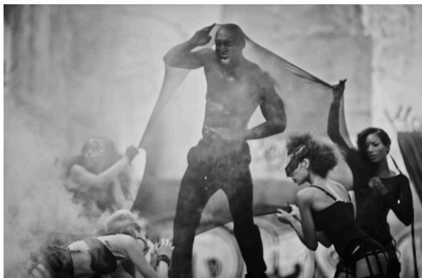
Picture 11: Four women succeed in capturing a man, the man wears black trousers, the women black outfits with much leather Screenshot 0:03 (“Nicki Minaj - Only”)