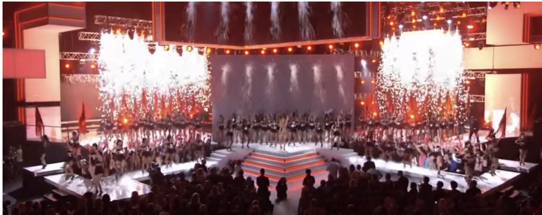
Picture 1: 2011 Billboard Awards Performance of “Run the World (Girls)” Screenshot 06:57 (“Beyoncé - Run The World (Girls) Live”)