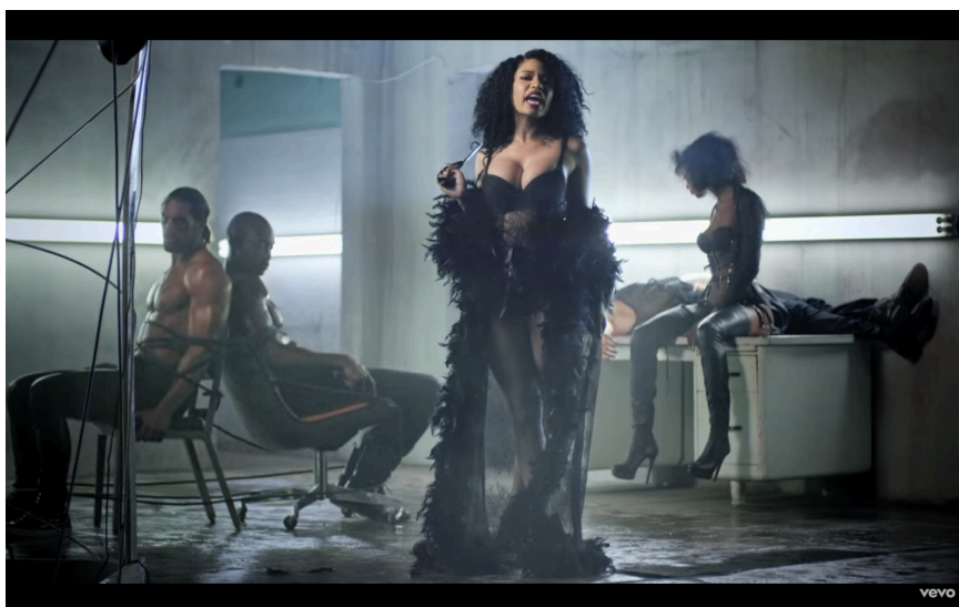
Picture 12: Minaj is in control of two men tied to a chair, holding a whip in her right hand and exuding confidence. Screenshot 0:55 (“Nicki Minaj – Only”)