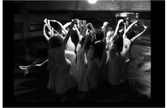
Picture 7: A group of Black women dance with connected sleeves. Screenshot 00:11:08 ( Lemonade , Dir. Åkerlund et. al.)