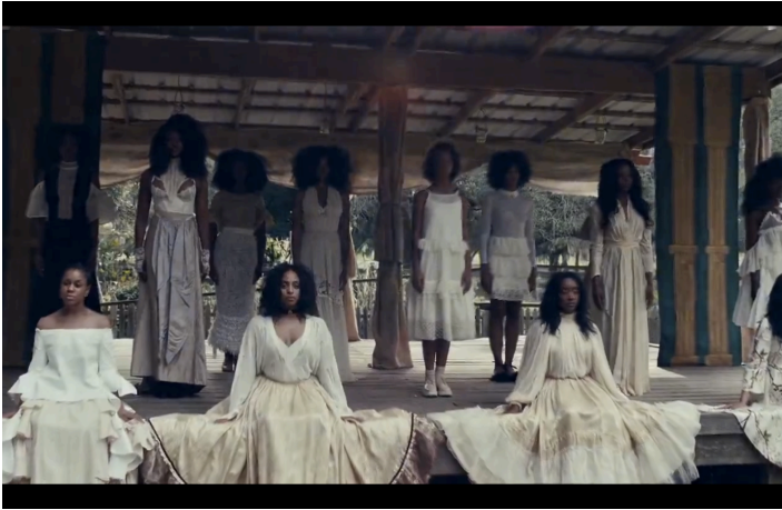
Picture 6: A large group of Black women standing on a stage. Screenshot 00:02:29 ( Lemonade , Dir. Åkerlund et. al.)