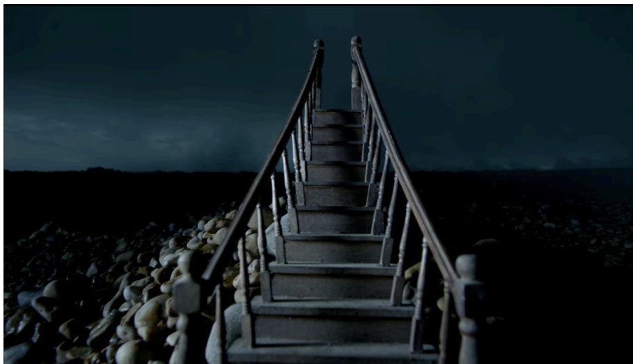
Picture 14: An empty staircase leading to nothing at the start of the “Freedom” music video. Screenshot 0:05 (“Nicki Minaj – Freedom”)