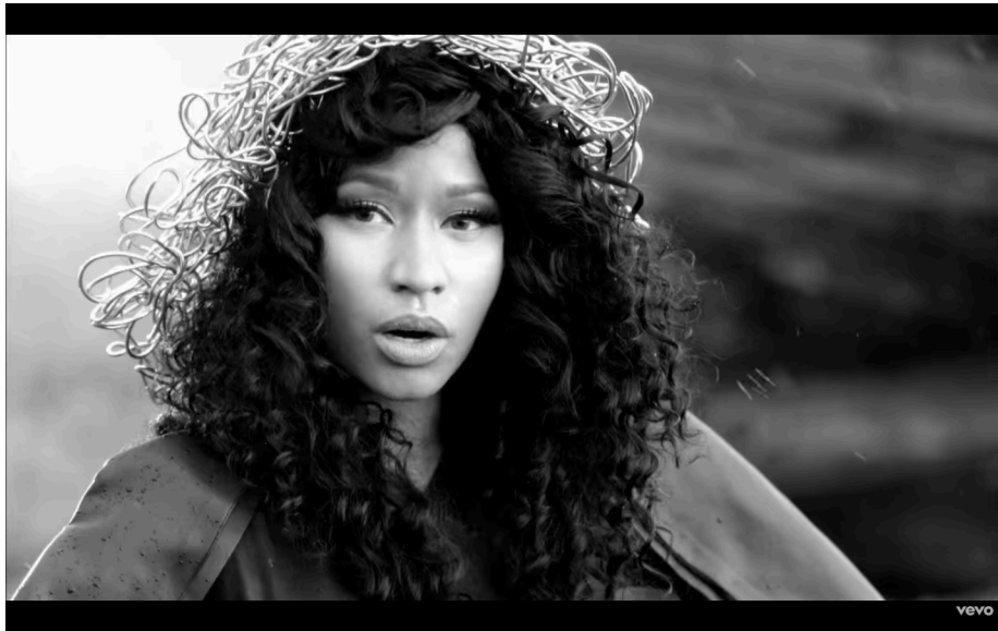
Picture 16: Nicki Minaj with a headpiece resembling a modern crown of thorns. Screenshot 0:44 (“Nicki Minaj – Freedom”)