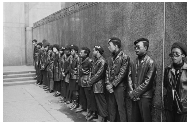
Picture 5: Members of the Black Panther Party protesting at the New York City courthouse in 1969 (Fenton)