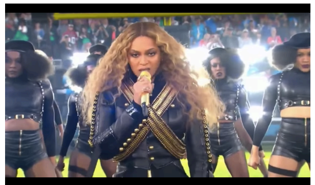
Picture 3: Beyoncé and back-up dancers wearing outfits resembling those worn by the Black Panther Party Screenshot 02:17 (“Super Bowl”)