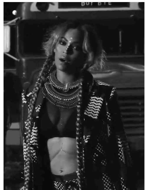
Picture 9: Beyoncé with face paint and traditional necklaces. Screenshot 00:19:57 ( Lemonade , Dir. Åkerlund et. al.)