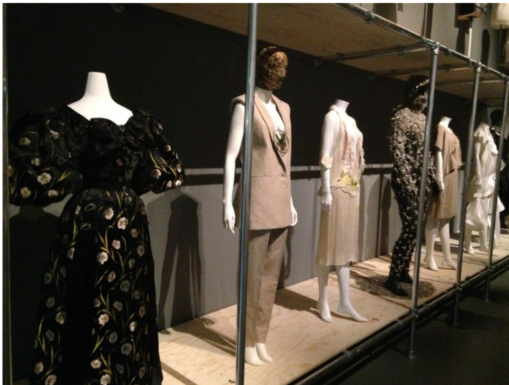
16. Van Hilten, Judith. The room of The Restorer . 2017. Photograph. Centraal Museum, Utrecht.