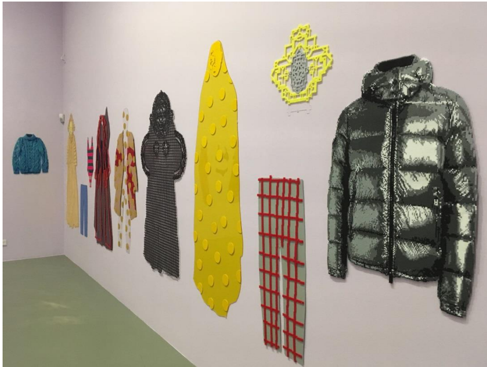
19. Van Hilten, Judith. Das Leben am Haverkamp . 2017. Photograph. Centraal Museum.

clothing designs made from various colourful and reflective materials were hanging on the walls. A screen showed video fragments of the fashion show of this collection. With this collection the collective questions the functionality of clothing by designing clothes that cannot be worn and only serve to express their artistic vision. There was no information available about the various materials or the methods that have been used in the design process.