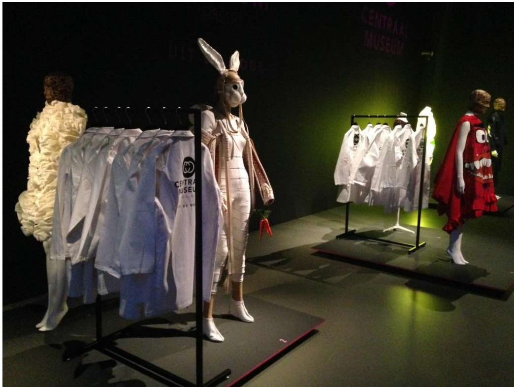
17. Van Hilten, Judith. The room of The Visionary . 2017. Photograph. Centraal Museum, Utrecht.

The second part of the room is reserved for the project FAUXever resulting from the collaboration between designer duo Maison the Faux and the artist Hendrickje Schimmel of Tenant of Culture. Six pieces from Maison the Faux's collection Faux Cosmetics are preserved 'for eternity' by various objects and materials, like concrete, melting wax and silk organza. The creators were inspired by the different themes of the exhibition, all relating to the preservation of the museum's collection. With this experiment, the creators try to break through the boundaries that separate fashion from art by means of a multidisciplinary approach (Bloemberg et al., 2017: 10). On the left and right wall, a text provides context information to the visitor and the title of the project and the creators are projected in large purple letters. Two screens show fragments of Maison the Faux's fashion show.