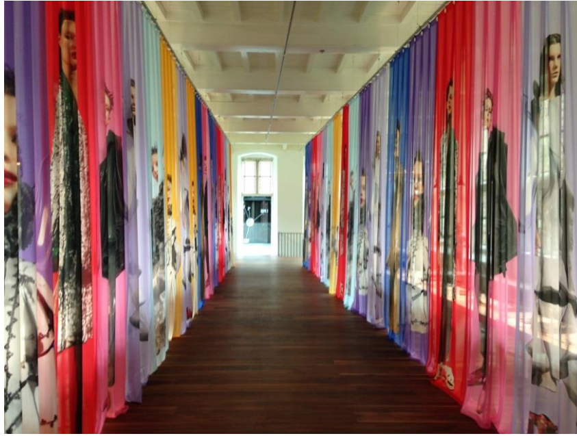
11. Van Hilten, Judith. Colourful curtains at the entrance . 2017. Photograph. Centraal Museum, Utrecht.