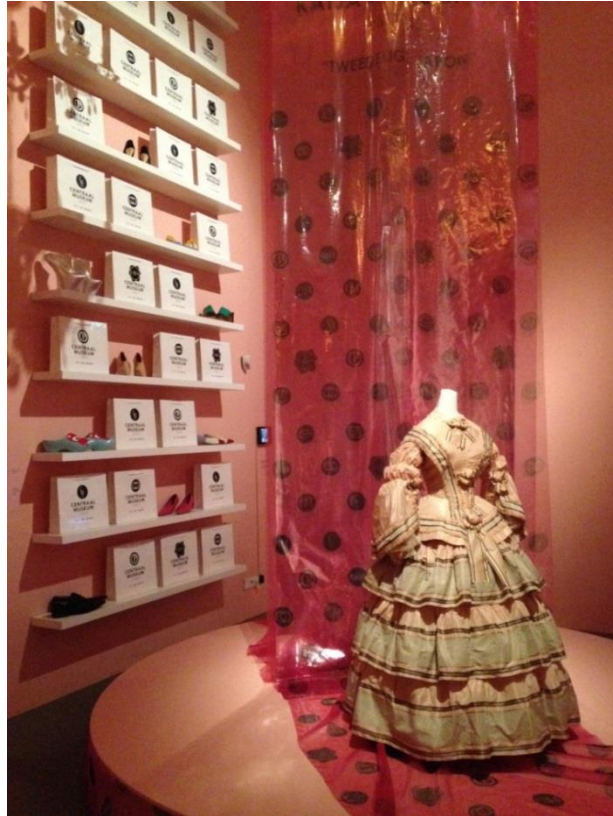
14. Van Hilten, Judith. The room of the Wearer . 2017. Photograph. Centraal Museum, Utrecht.