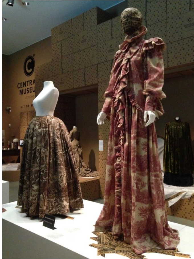
12. Antiquated and contemporary Toile de Jouy designs in the room of The Maker. 2017.