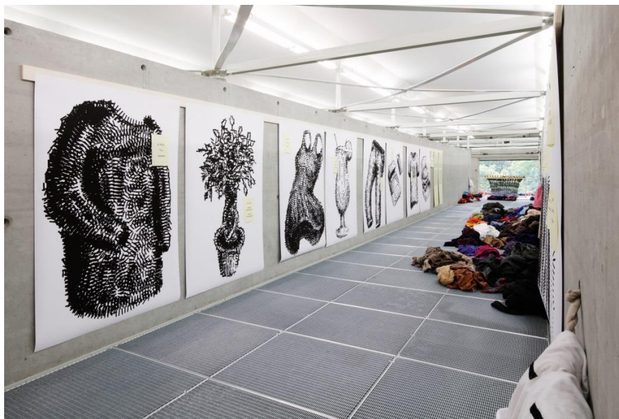
10. Schwartz, Johannes. Fashion Data & Fashion Machine . 2015. Photographic. Het Nieuwe Instituut, Rotterdam.

fleece sweater formed the inspiration for this installation, as this item is discarded in huge amounts, but is not suitable for resale on markets in other parts of the world. For Fashion Machine many of these sweaters, most of them provided by Wieland Textiel, were cut and its yarn was draped around large spools. Large amounts of fleece sweaters and the spools with the yarn were scattered all over the floor of the exhibition space. Flags and mattresses were knitted from the yarn and the flags were hung from the railings on the third floor. Visitors could actually contribute by knitting parts of the flags themselves. Through this installation, the practices of fast fashion and its production mechanisms were made tangible for the public.