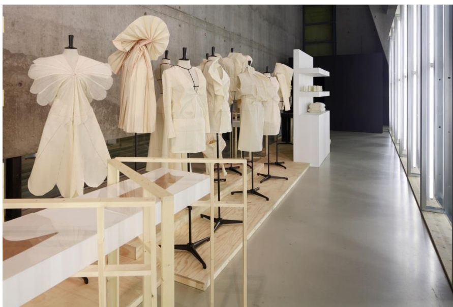
6. The School. 2015. Photograph.