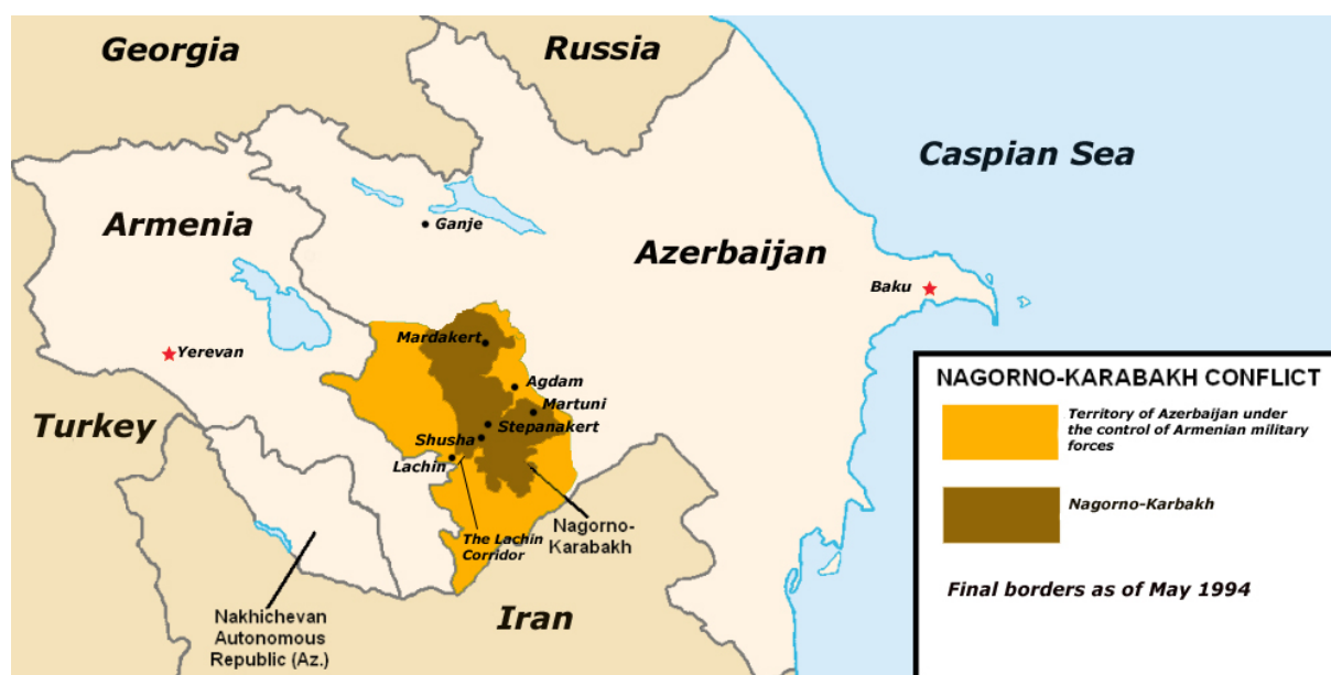
Figure 1.2: Nagorno-Karabakh and territory under Armenian control

Members of parliament are being characterized as pro-government deputies and businessmen. Members of the 'Karabakh party' are solidly in charge ever since the end of the war in 1994 (de Waal, 2010).