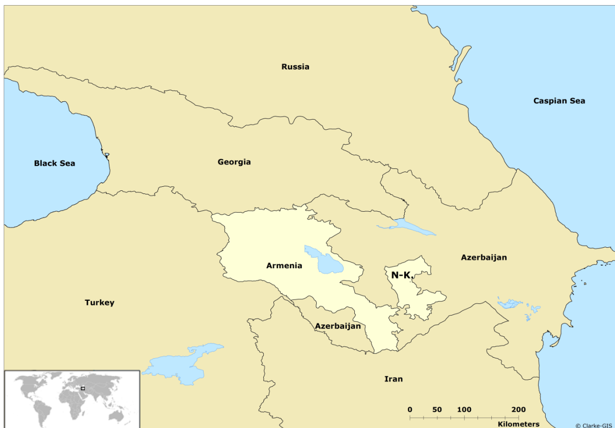
Figure 1.1: Armenia within the Caucasus region

Armenia is an interesting research topic due to the fact that its society has gone through a solid phase of Europeanization; since its separation and independence from the USSR in 1991 and reasonable economic growth in the 2000s. With society slowly moving towards Europe, its political elite has not changed since the beginning of the 1990s. Armenia political landscape is influenced by two major events: the war with Azerbaijan in 1990s over Nagorno-Karabakh and the parliamentary shootings of 1999.