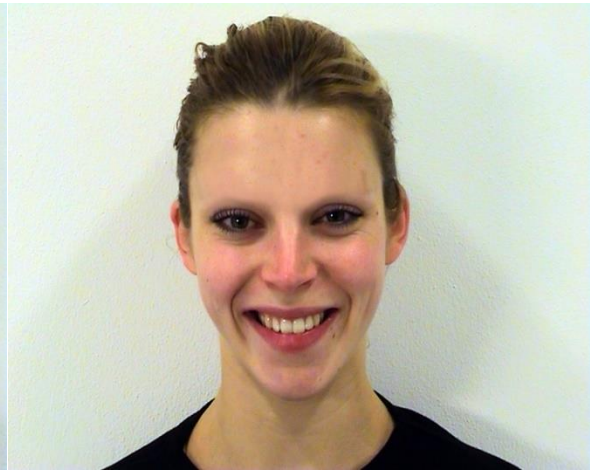
4. Happiness without eyebrows