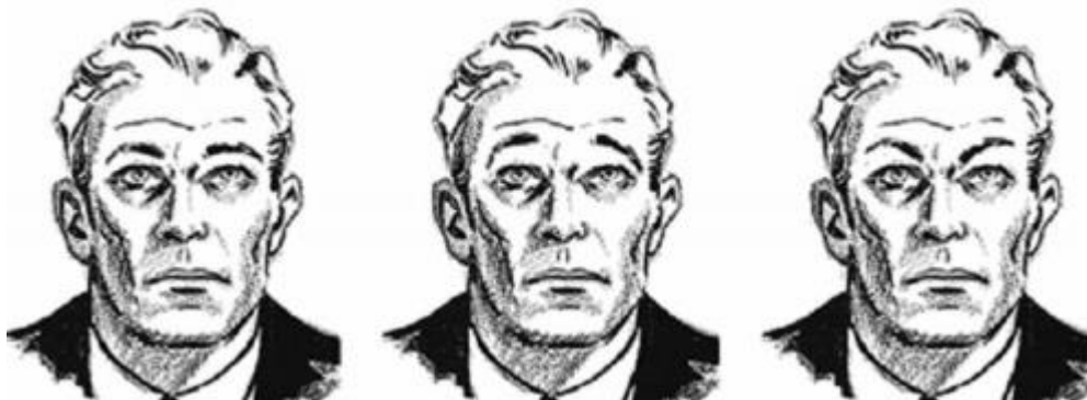
Figure 1. Cartoon drawing of the influence of the eyebrows. (Left, neutral; Middle, surprise/fear; Right, anger)

This applied to the visualisation of the emotions happiness, surprise and anger. Sadr et. al (2003) came to the same conclusion. In figure 1 below it is visible that with only altering the eyebrows, one is able to change their expression entirely (Sadr et. al, 2003).