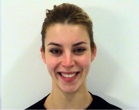
2. Happiness with eyebrows